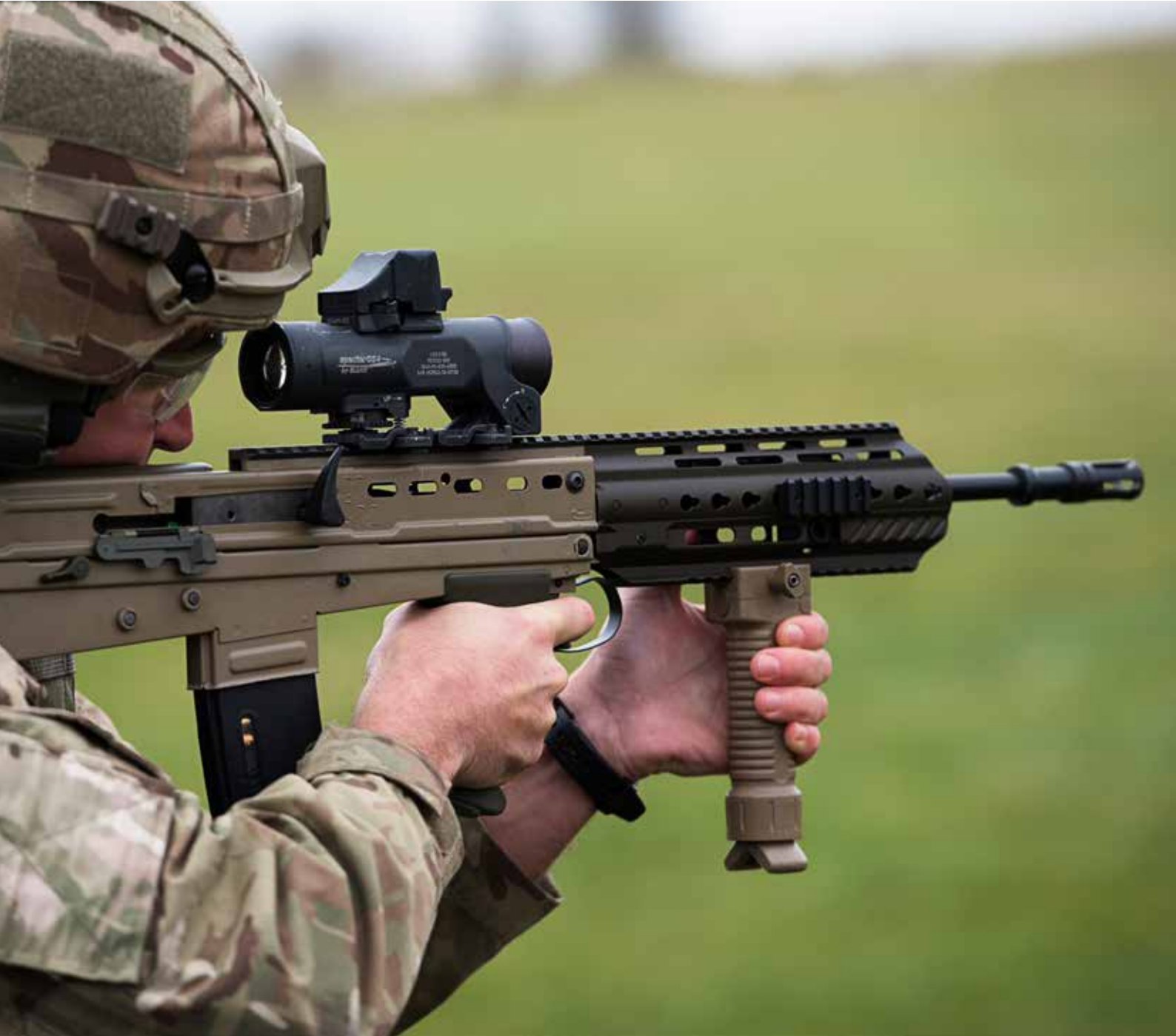
Pictured: A new SA80 A3 rifle at the Infantry Trials Development Unit at Warminster