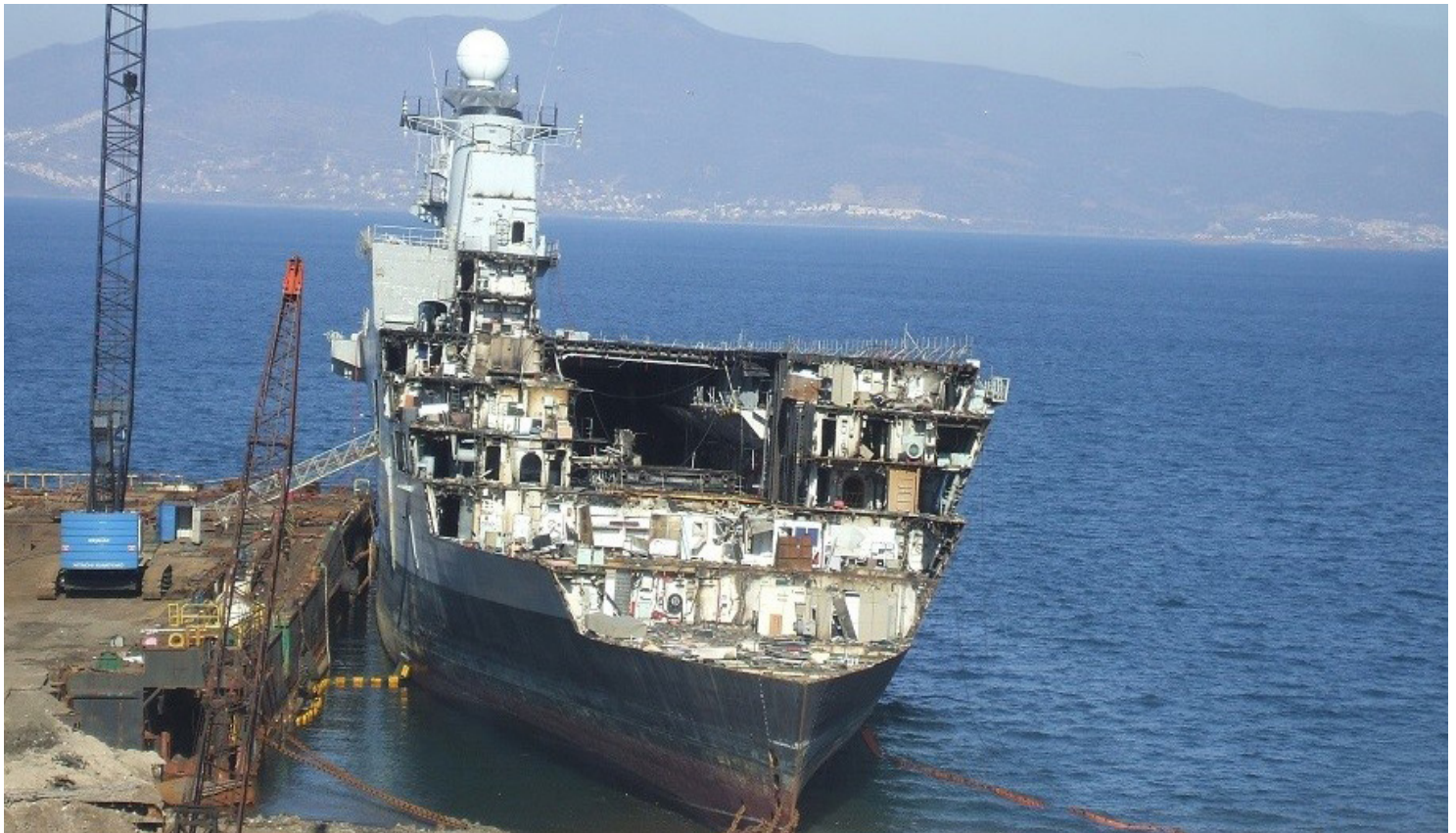
1 February 2017 Progress of works showing the start of dismantling of the flight deck, airplane garage and bridge.

The photographic evidence shows the dismantling progress and this coincides with the monthly reports, demo schedule and the sales progress.