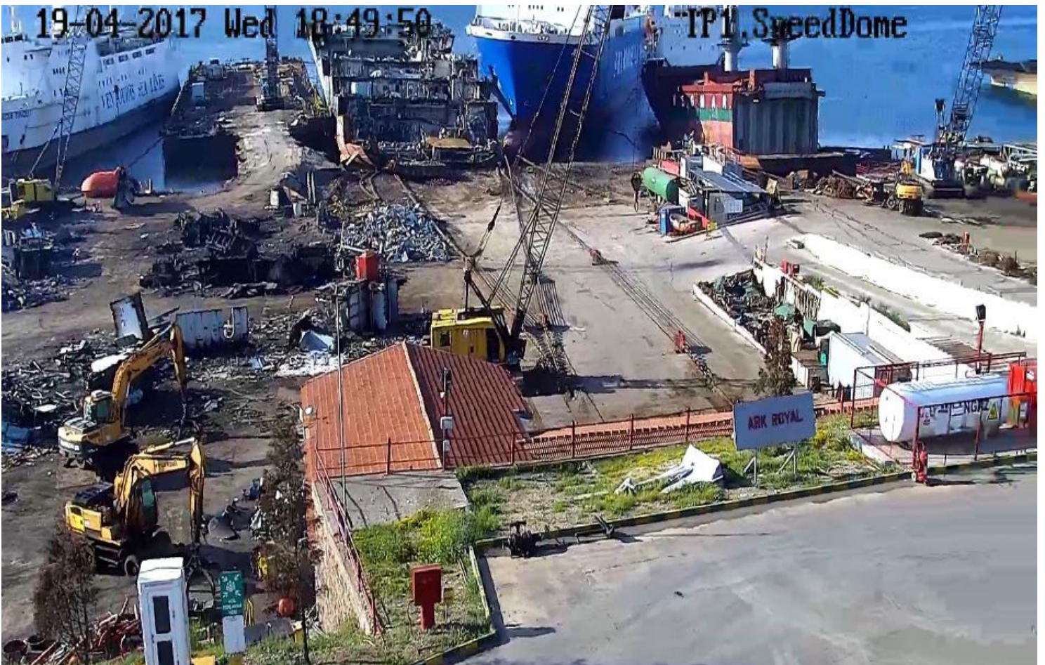
Progress of works as of the 19 April 2017.