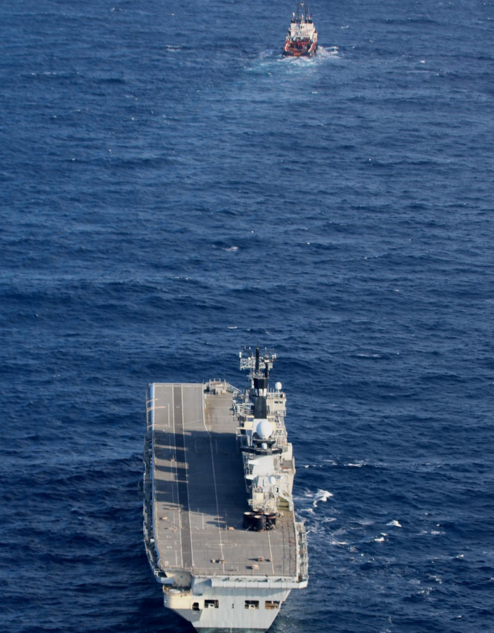
22 Dec 2016 - Aerial view of the former HMS Illustrious passing through Malta.