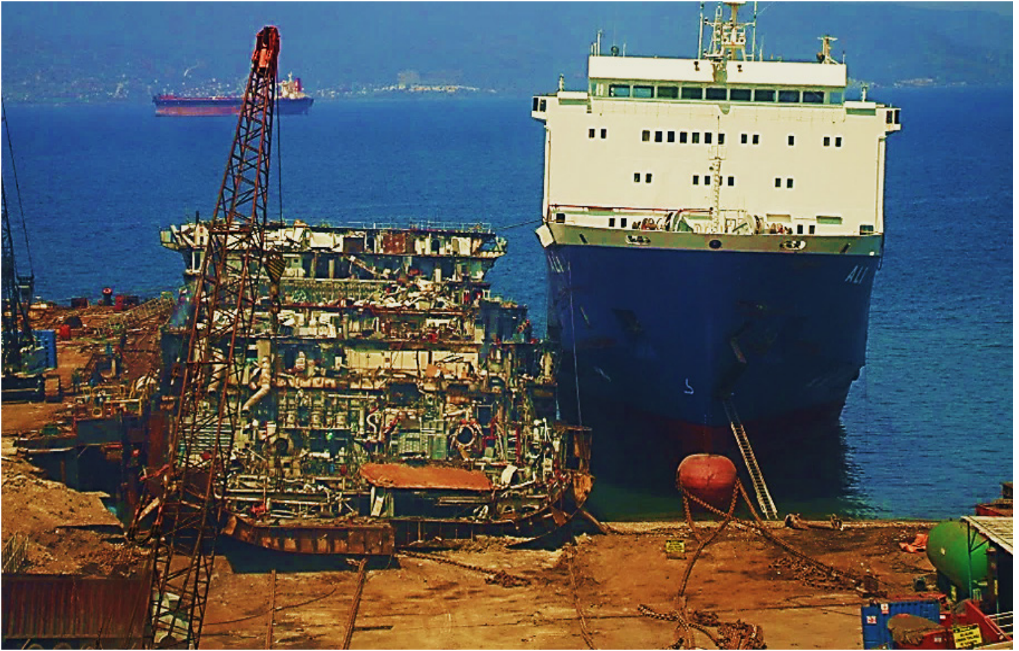
3 May 2017 Ship on slipway.