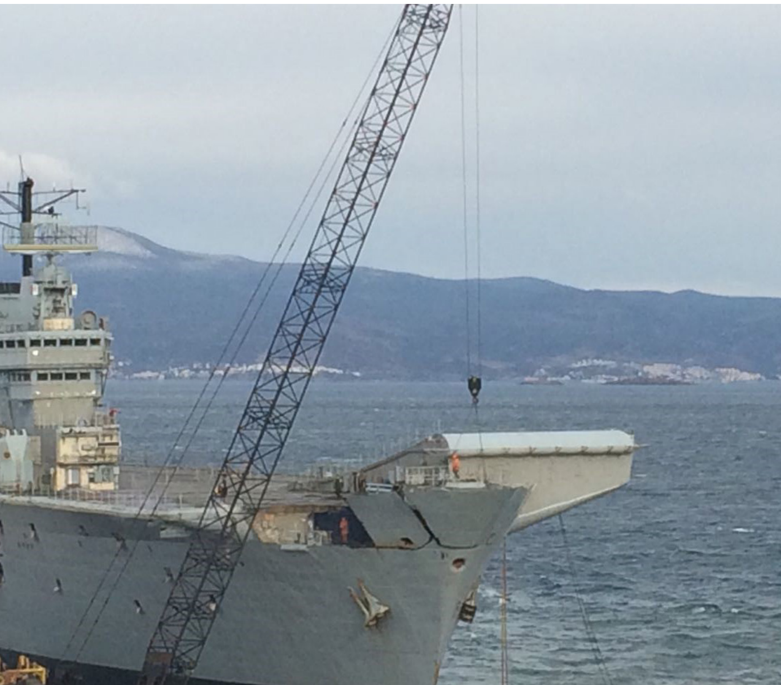
Start of the flight deck dismantling on 30 December 2016.

Photographic evidence was provided at key stages of the dismantling process ensuring that DESA could be confident on the method and manner in which the vessel was dismantled and recycled.