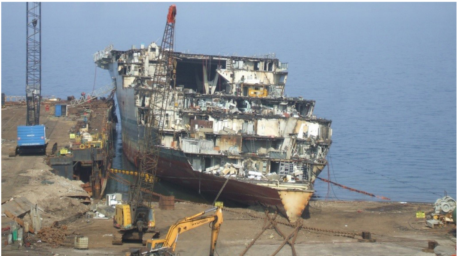
Progress of works as of 28 February 2017.