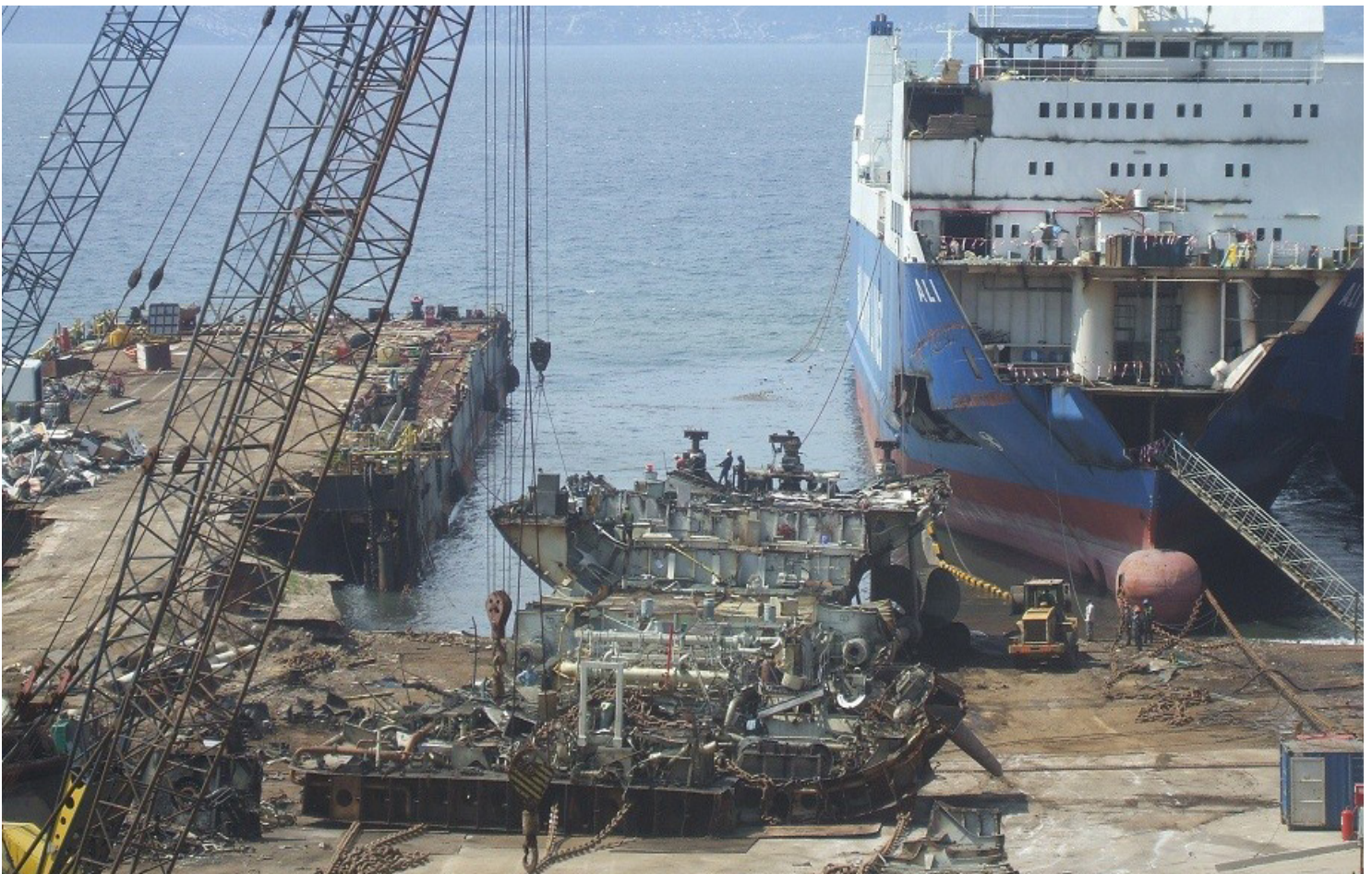
12 June 2017 the former HMS Illustrious as a hull has been fully dismantled.