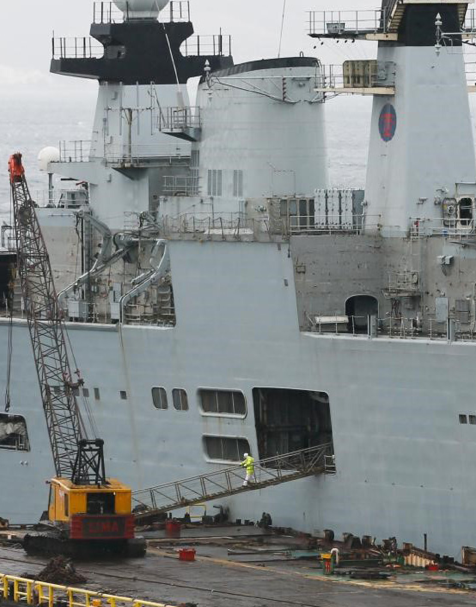
Arrival Photo 27 Dec 2016.