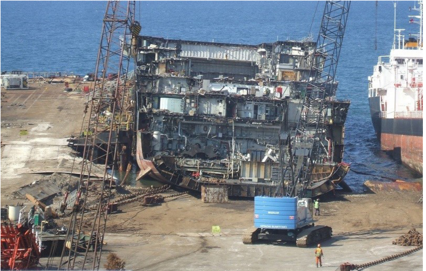
Progress of works as of 28 March 2017.