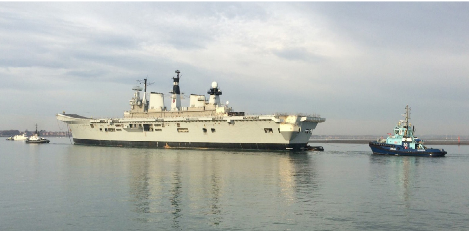
'Lusty' departed from HMNB Portsmouth under the towage of AHT ERACLEA on her final voyage to the ship dismantling facility in Aliaga, Turkey on 7 December 2016.