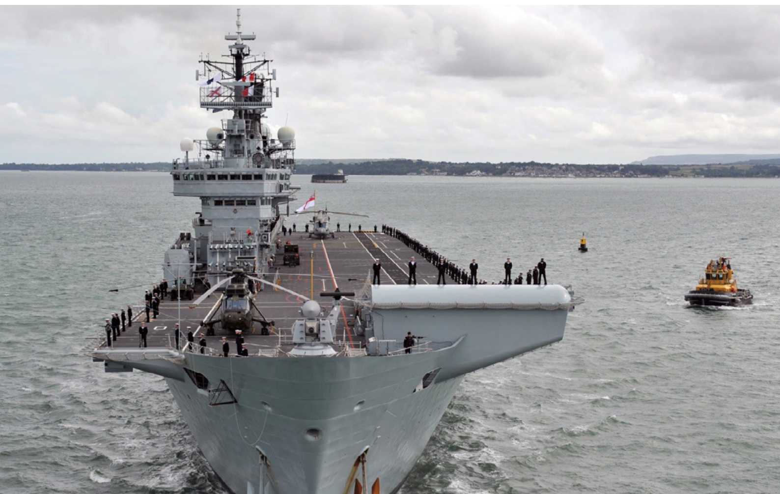
Royal Navy Aircraft Carrier the former HMS Illustrious is pictured returning to Portsmouth on 7 July 2011 following her refit in Scotland.

The vessel left HMNB Portsmouth under tow on 7 December 2016 and arrived in Turkey on 27 December 2016, taking less than three weeks. On 22 June 2017 LEYAL reported that the vessel had been completely dismantled and recycled in accordance with the relevant EU waste management legislation and the UK's ship recycling strategy in just six months.