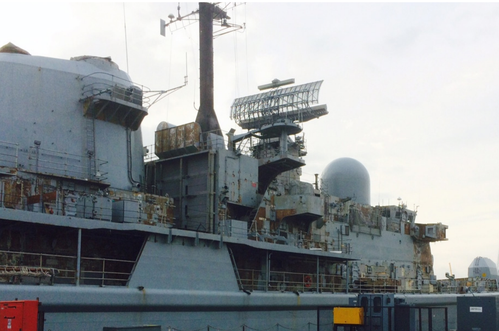
Prior to any sale, HM vessels have the radar absorbent sheeting (RASH) removed as part of the declassification of the vessel, this process takes three to four months. (Type 42 frigate used for illustration)

The ship recycling plan is paramount to the consideration of offers to purchase and provides evidence to enable the evaluation committee to score each of the tenders.