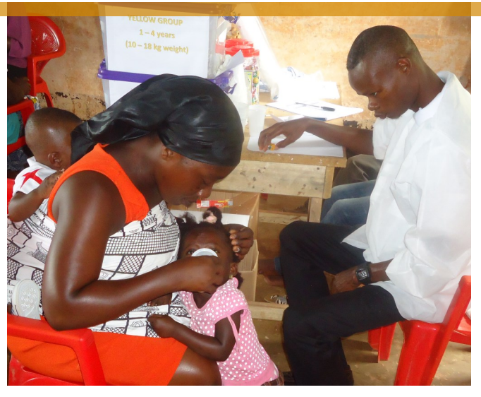
A mother gives her child the first dose of SMC observed by a trained member of the study team

Children who reported illness or fever at the time of SMC administration were screened with a rapid diagnostic test and, if positive, treated with either a short-acting or long-acting antimalarial therapy according to their research group.