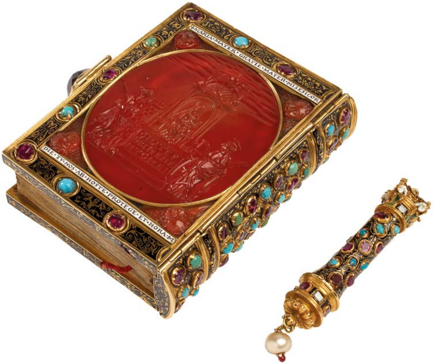
Plate 2a Book of Hours in enameled gold binding (exterior)