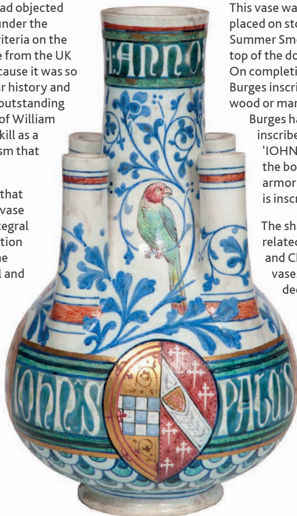
Plate 1a William Burges vase from the Summer Smoking Room at Cardiff Castle (front)

The shape of the vase was very closely related to European, Middle Eastern and Chinese examples of multi-necked vases. The bright polychrome and gilded decoration drew on European maiolica,