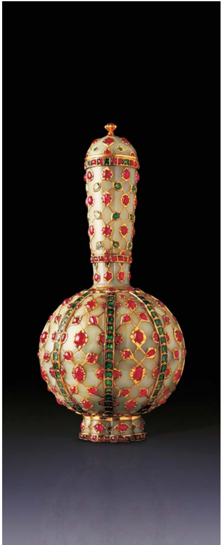
Plate 11 Mughal ruby- and emerald-inset flask

During the initial deferral period a serious expression of interest to raise funds to make a matching offer for the flask at the fair matching price of £6,000,000 was made by a public body. A decision on the export licence application was deferred for a further six months. Shortly after that the owner concluded that it did not wish to sell the flask. The Secretary of State therefore decided to refuse an export licence. This is in accordance with the published guidelines to exporters.