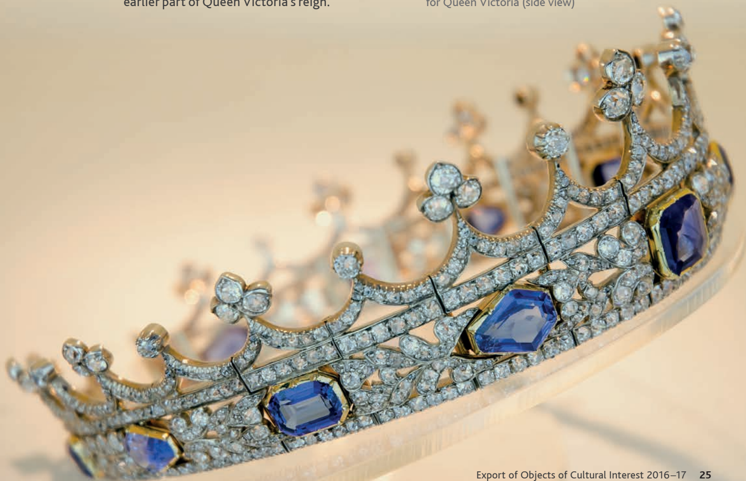
Plate 4a Sapphire and diamond coronet commissioned for Queen Victoria (side view)

The applicant declined to comment on the Waverley status of the coronet.