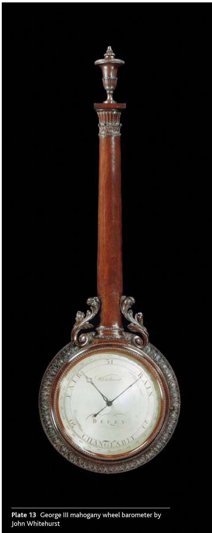
Plate 13 George III mahogany wheel barometer by John Whitehurst

This barometer was one of a small number of this design known to have been made by the Whitehurst family of Derby, clockmakers and scientific instrument-makers trading at 22 Irongate, Derby. The expert adviser noted that it was difficult to determine with certainty which member of the family made this type of barometer, as John Whitehurst (1713–88) spent much of the late 1770s moving between Derby and London, eventually settling in London permanently.