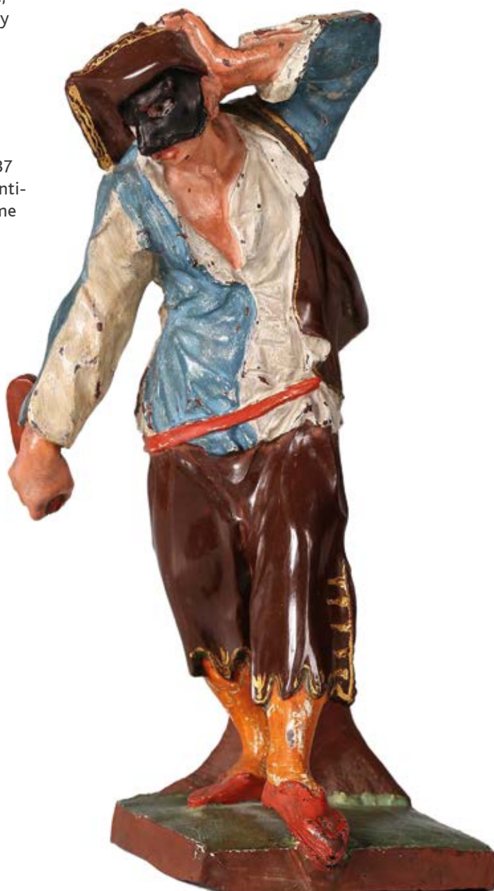
Plate 15 Meissen figure of 'Pulcinell'