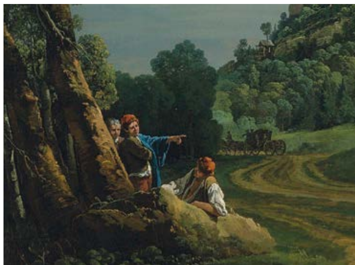
Plate 8 (detail) The Fortress of Königstein from the North by Bernardo Bellotto

We heard this case in October 2016 when the painting was shown to us. We found that it met the second and third Waverley criteria on the grounds that its departure from the UK would be a misfortune because it was of outstanding aesthetic importance and it was of outstanding significance for the study of Bellotto, military prowess, dynastic strength and enlightened rule. We recommended that the decision on the export licence application should be deferred for an initial period of three months to allow an offer to purchase to be made