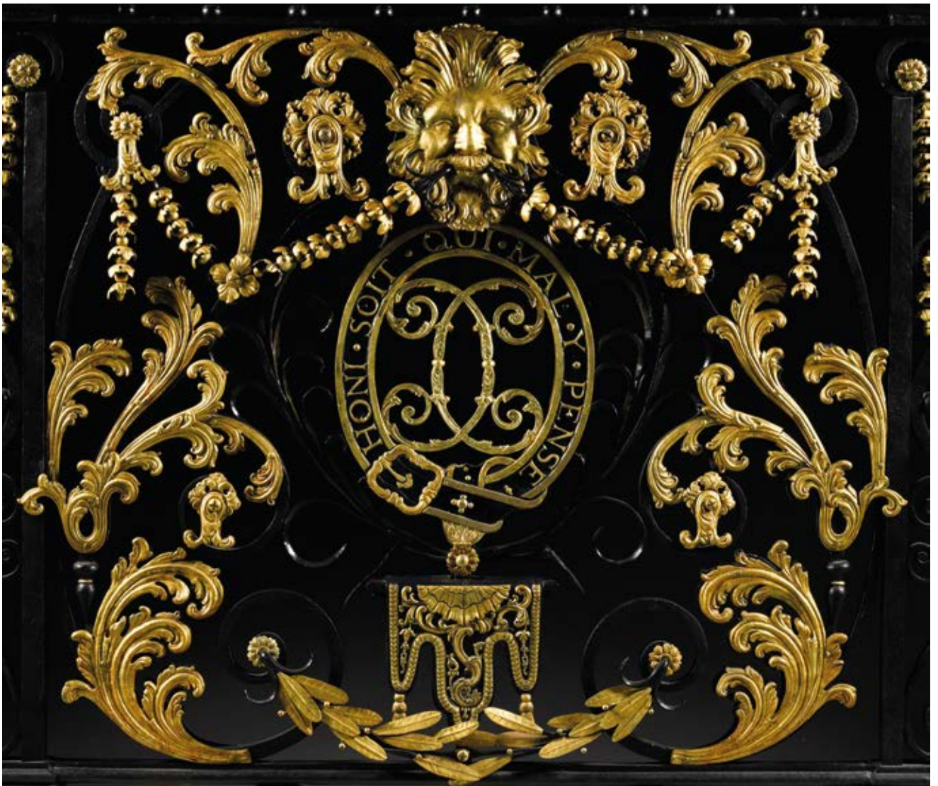
Plate 14 and detail English gilt bronze, painted and cast iron railings

The attribution of the railings to Jean Montigny was based on their obvious quality and the fact that Montigny worked for the Duke of Chandos at Cannons. Unfortunately, however, it was impossible to prove this attribution. The set of six railings had been significantly restored and adapted, and as the Devonshire House gates were a better example of Montigny's work (and could be firmly attributed to him), they did not believe that these were outstanding examples for the study of early 18th-century ironwork or Montigny's oeuvre.