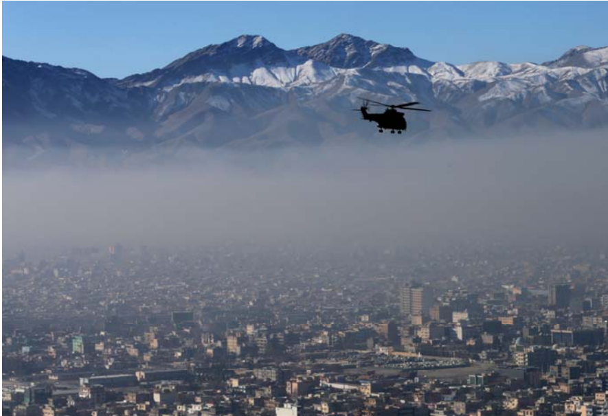
Figure 4: An RAF Puma deployed on Operation TORAL in Afghanistan

During the latest six month period 1 October 2017 to 31 March 2018 (Q3/Q4 2017/18), there were no UK Entitled civilians who sustained an injury or had an illness whilst on Op TORAL.