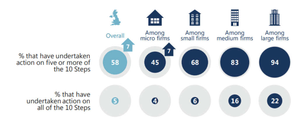
Figure 2: Progress in undertaking action on the 10 Steps by size of business

Source: Cyber Security Breaches Survey 2017<sup>13</sup> (diagrammatic arrows indicate changes from last year)