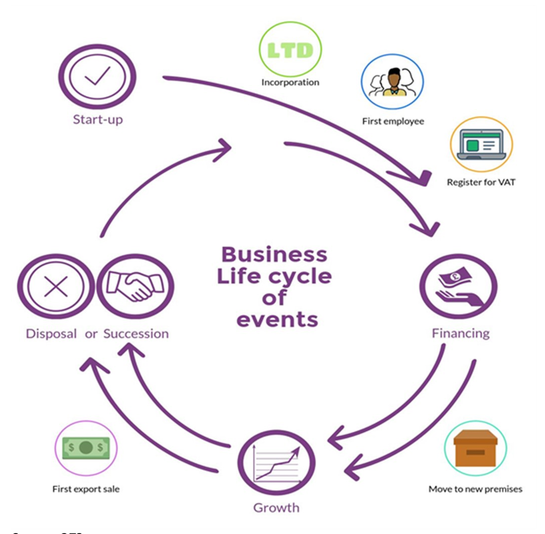
Chart 1.A: Business lifecycle of events