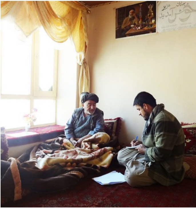
Conducting an interview in Afghanistan.

Likewise, when people's satisfaction with services improves, there is no consistent relationship with improved perceptions across countries or sectors. For example, satisfaction with health services appears to make a difference to perceptions in DRC, but not consistently elsewhere.