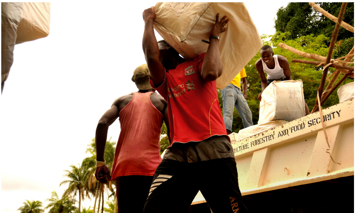
Service delivery: unloading food aid, Sierra Leone.