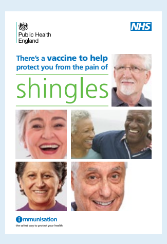
Leaflet (weblink 11) Product code: 2942856