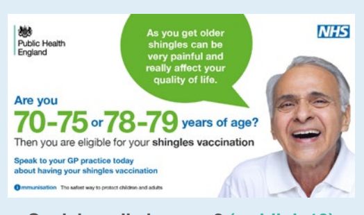
Social media banner 2 (weblink 10)