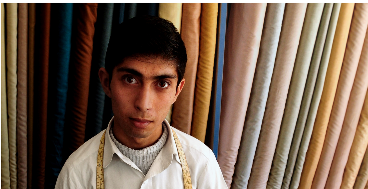
Image: trainee tailor, Afghanistan.

conditions in place to support the behaviour changes that are being sought? This is often referred to as an ‘enabling environment’, where the wider context facilitates the desired behaviour changes. In such a setting, knowledge transfer may enable behaviour change. In many cases, however, what we find are ‘disabling environments’ that work against translating knowledge into practice.