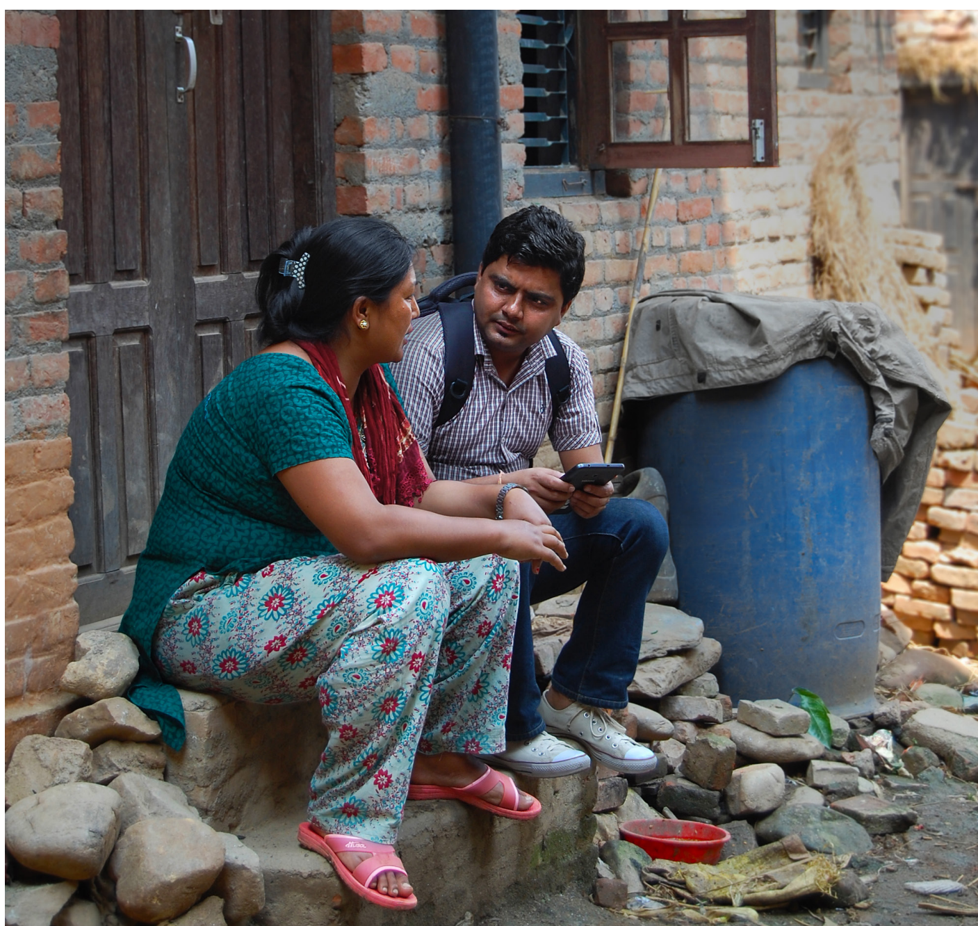
Image: interview, Nepal.