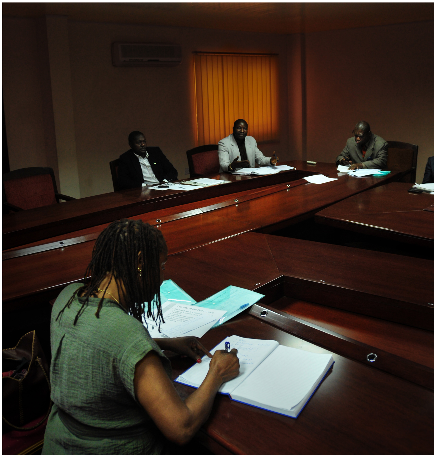
Image: Scaling Up Nutrition (SUN) Secretariat board meeting.

includes both grey literature, often focused on the technical ways of undertaking capacity development, as well as academic literature that seeks to analyse the ‘stuff’ of capacity and critique its mainstream practice. As the SLRC authors have sought to situate their findings within current and evolving debates, the material that we draw upon cuts across how capacity development is practised as well as how it is thought about within the aid community.