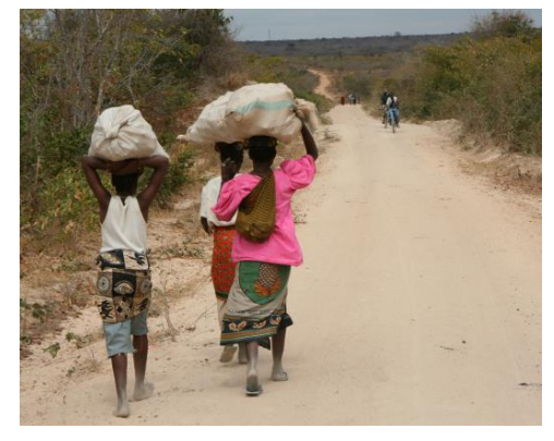
Figure 4: Women Headloading along a Rural Road

Cultural transition is a slow process and differs from one region to another. The increased sensitisation by various NGOs, media and role models is impacting on attitudes and cannot be entirely transformed by legal and institutional provision alone.