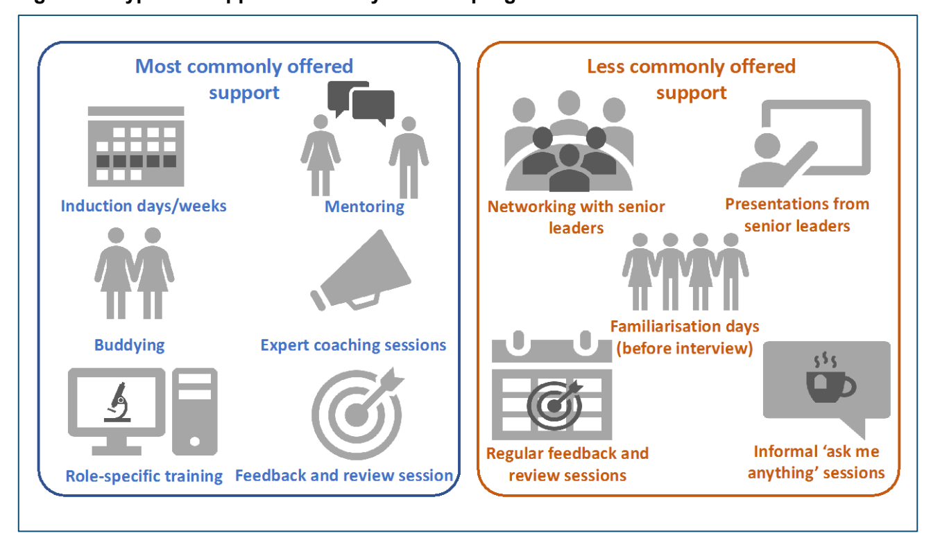
Figure 4 - Types of support offered by returner programmes

The details of these support mechanisms are outlined below: