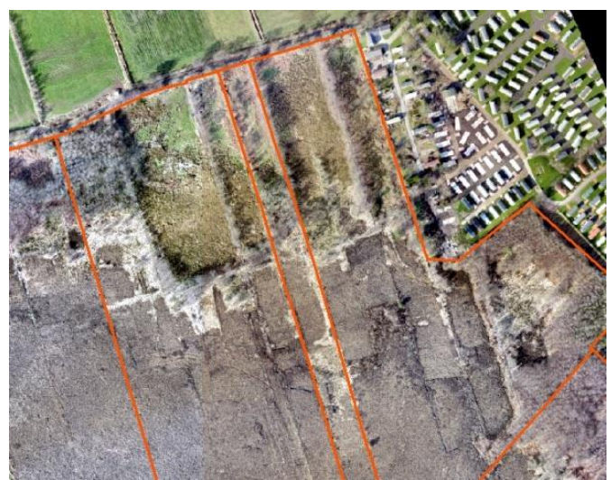
Aerial photo showing the old peat cuttings area on Glasson Moss, where the restoration work will take place. Glendale Caravan Park can be seen to the right.

Natural England has been working with the owners of the caravan park, to create a restoration plan. The aim is to raise the water table just enough to allow the Sphagnum bog mosses to grow again, much like you see in our other restoration projects such as Wedholme Flow.