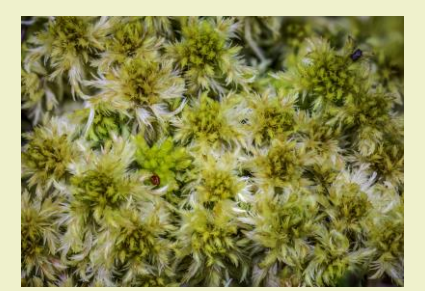
Sphagnum Moss – the peat bog builder