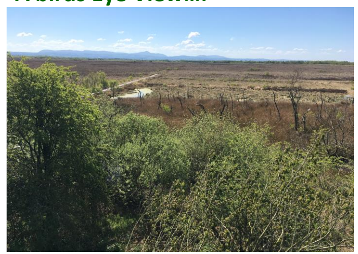
Do you recognise this "bird's eye view?" You can find out where it is further on!