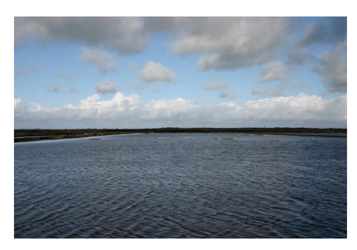
Wedholme Flow – the centre looks more like a lake that a lowland raised bog!

The most damaged part of the bog is in the centre where peat was extracted on an industrial scale. Here there are large hollows and almost no gradient. This means that it is very difficult for water, which enters the bog as rainfall, to drain away. Sphagnum mosses and other bog vegetation cannot grow in the open water, except around the edges. To solve this problem, we have put in drains which will allow this excess water to run off the bog and enable the vegetation to re-colonise.