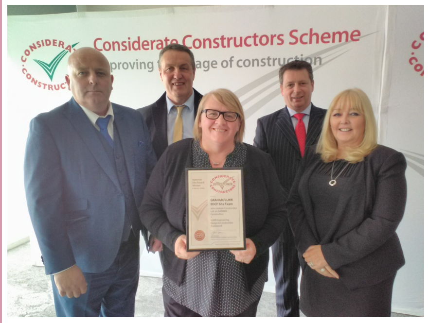
In the frame: Representatives of LLWR and GRAHAM Construction collect their accolade at the CCS awards in Manchester

Our Framework partnership with GRAHAM Construction has been recognised at the Considerate Constructors Scheme (CCS) awards in Manchester.