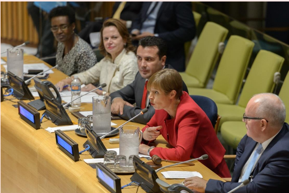
Image 3: President of Estonia Kersti Kaljulaid discusses how open government can renew democracy and rebuild citizen trust alongside other high-level leaders during an Open Government Partnership (OGP) event at the 72nd United Nations General Assembly

We will work with UK businesses, the private sector, other UK government departments, and global civil society organisations to explore the demand for services which help companies prevent bribery and share successful business practices for engaging with new markets in developing countries. We're investing in new technologies to help businesses trace their supply chains. And we'll make sure that transparency and anti-corruption are part of the UK bilateral and regional trade dialogues, as new trading agreements are explored.