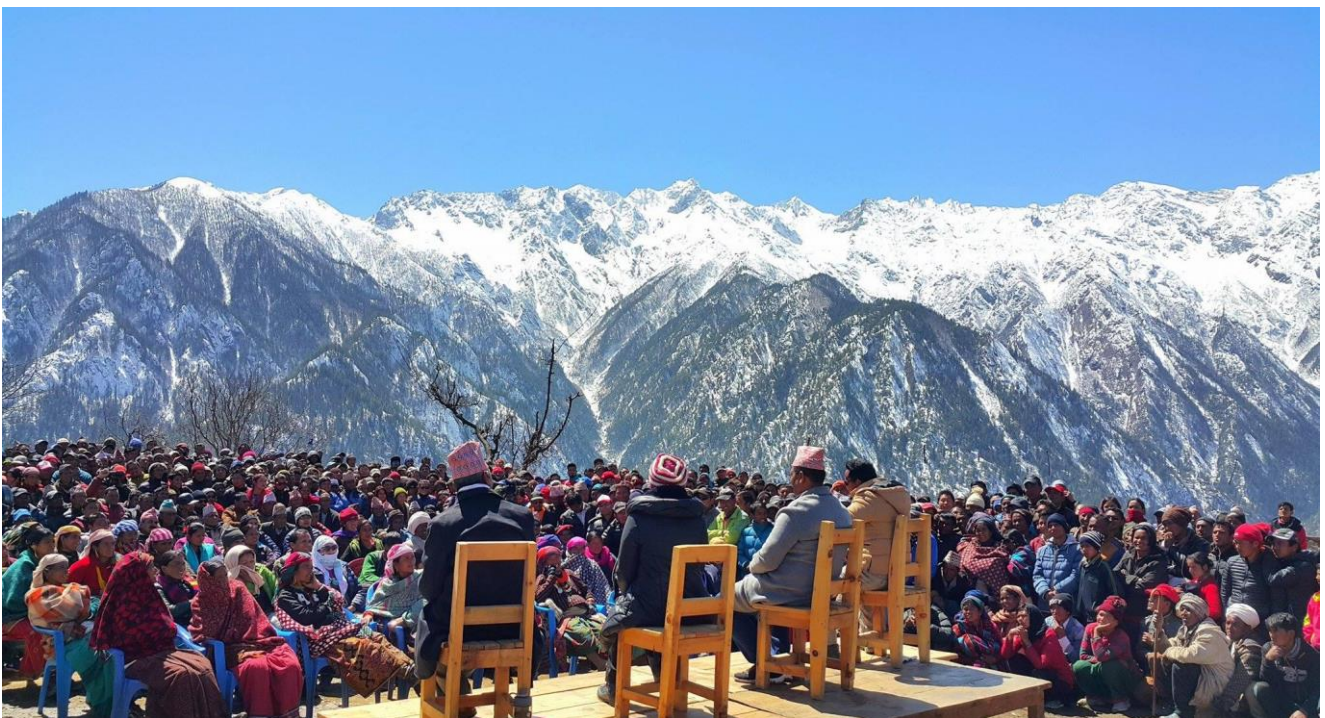
Image: 4 BBC Media Action, filming of Sajha Sawal in mountains in rural Nepal. Sajha Sawal (Common Questions) is a weekly political debate programme broadcast across Nepal on radio and TV.

We know that this will take time, but we are joining up across government and internationally to deliver the change. This is in our national interest; and will also help build a more stable, more prosperous world for all.