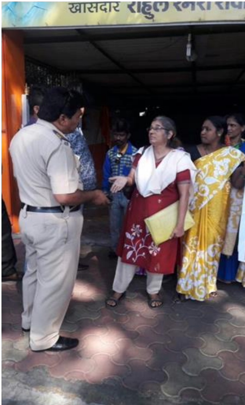
Image 2: Anganwadi workers presenting demands for the reversal of proposed budget cuts for the Integrated Child Development Services program in Maharashtra state on April 4, 2016.

A focus on fiscal transparency will be at the centre of our efforts. We will support national governments to open up their budgets to scrutiny. Where there is momentum for change we will support reforms which improve transparency of government expenditure, and enable citizens to track delivery of services such as health, education, water and sanitation that transform the lives of the poorest women and men, girls and boys. In ten of the very poorest countries we will work with governments to improve the way public money is managed, focusing on budget and procurement transparency, improved external oversight, and local participation. We will work with civil society organisations on their efforts to promote debate around budget data.