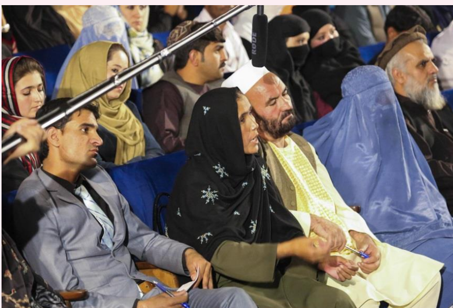
Image 1: Woman asking a question on BBC Media Action's Open Jirga - a debate show broadcast in Afghanistan.

But transparency on its own is not enough. To be useful, the evidence provided needs to be meaningful to ordinary people. Too often, data is not presented in an understandable way that enables citizens to find, interpret and use it. Evidence must also be accessible to parliaments, audit offices, media and civil society organisations that can monitor and champion improvements in services. The more information is put into the public domain and used in this way, the more accountable and responsive institutions become. For example, evidence shows that countries with a strong civil society tend to have less corruption, higher integrity, and more equitable allocation of funds for the public good 4 . Change is most likely to happen when diverse groups of people come together to rally around specific reform issues and make demands on their governments. 5