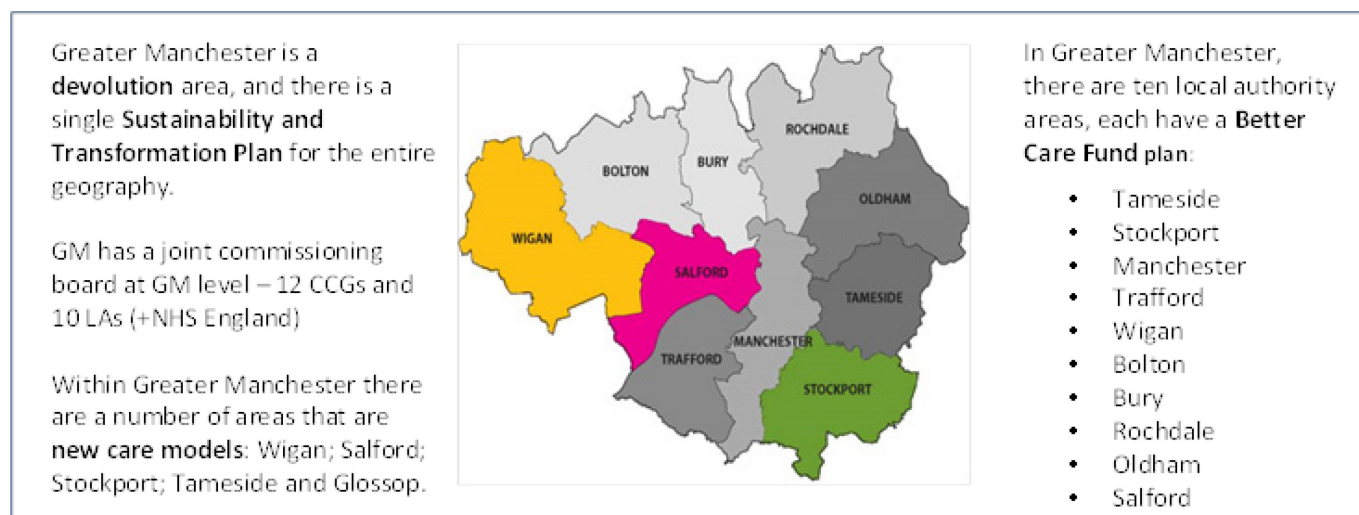
Figure 3 – Integration initiatives in Greater Manchester

There is a growing evidence base on the contribution that housing can make to good health and wellbeing. At a system level, poor housing costs the NHS at least £1.4bn per annum. And there are also costs to local government and social care. On an individual level, suitable housing can help people remain healthier, happier and independent for longer, and support them to perform the activities of daily living that are important to them – washing and dressing, preparing meals, staying in contact with friends and family.