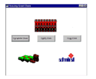
Figure 4.1 - Local Authority Menu

4.1.1. Insert claim form disk and double click on the icon created to initiate the software. The following menu screen appears.