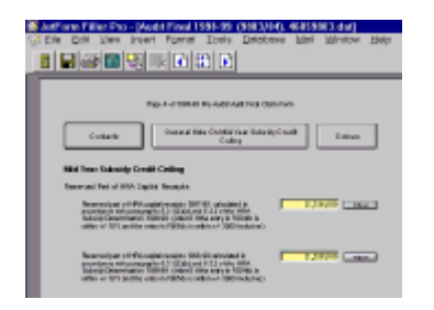
Figure 6.1 - Extract from a claim form

6.2. Set out above is an extract from a typical form. It shows: