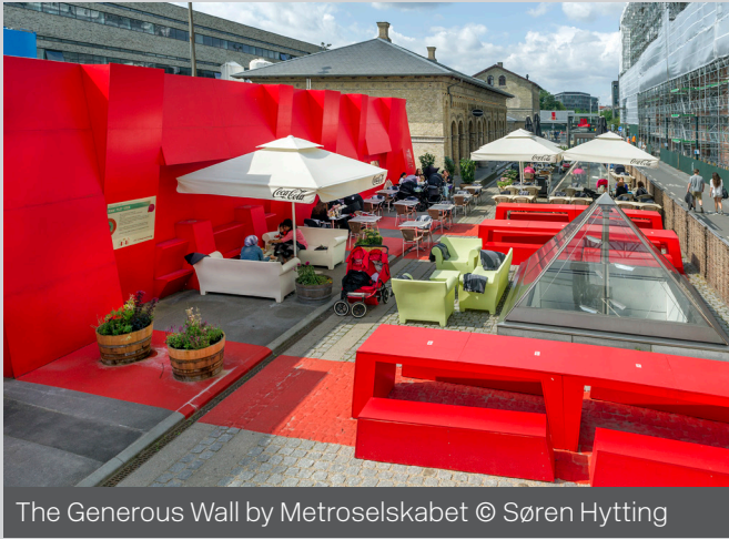
The Generous Wall by Metroselskabet