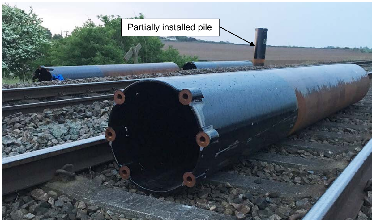
The pile as found by the tamper driver

On 14/15 May a planned possession of the lines from Preston Fylde Junction to Blackpool North was taken by the person in charge of the possession (PICOP) at 23:10 hrs and was due to be handed back at 06:10 hrs. The time available for piling work was restricted to allow the passage of a tamper at the start and end of the possession.