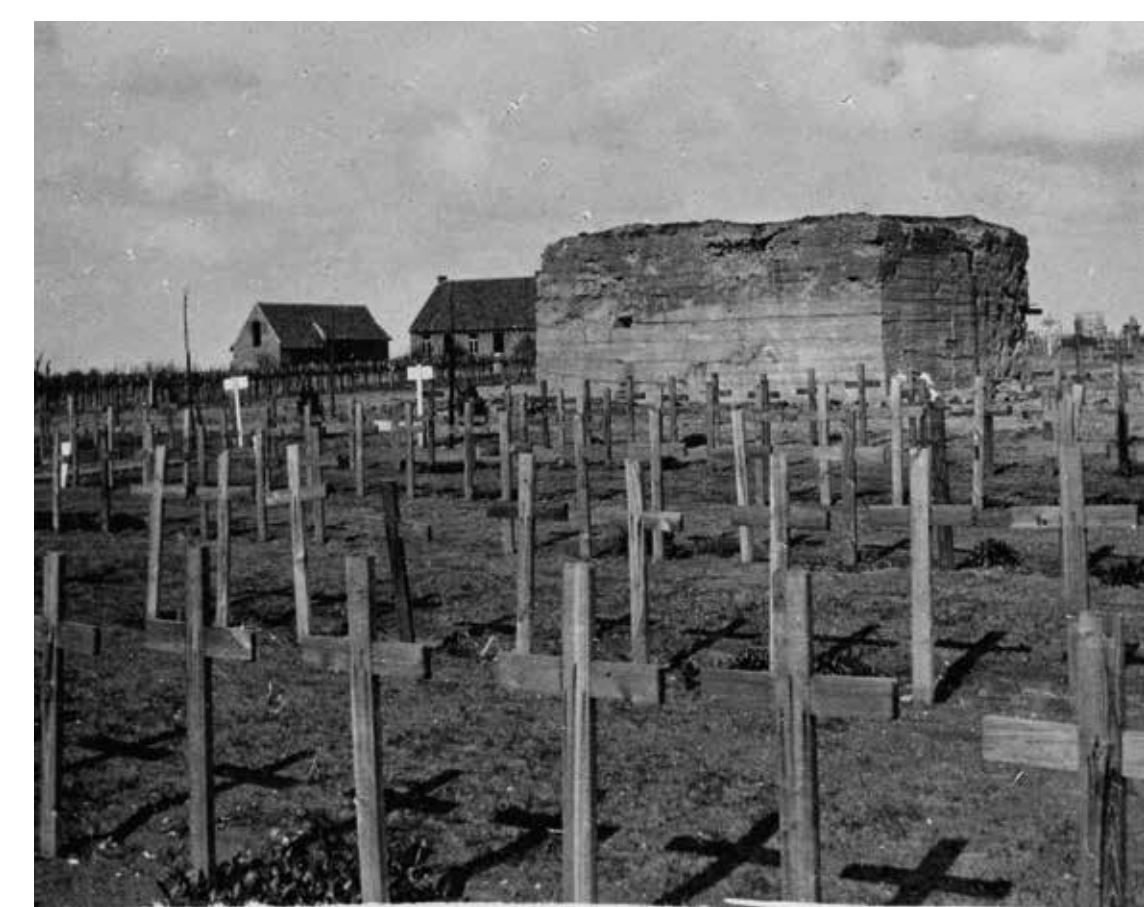
A German blockhouse at Tyne Cot Cemetery after the war

At the end of the ceremony, buglers of the Somerset Light Infantry sounded the 'Last Post' and pipers of the Scots Guards played a lament. Soon afterwards, the simple, solemn act of sounding the Last Post became a daily ritual, led by the local fire brigade of Ypres. It has been sounded under the arch every night at 8pm almost every day since, except during the Second World War when Belgium was again occupied. Today, organised by the Last Post Association, the ceremony is often