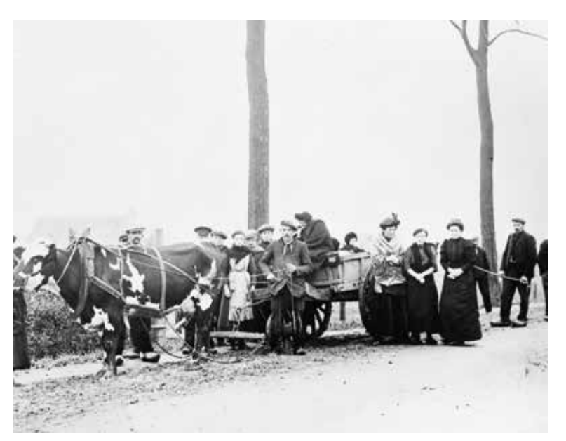
Civilians leaving Ypres, November 1914 © IWM

Ruins of the Cloth Hall, Ypres, 1916 © IWM