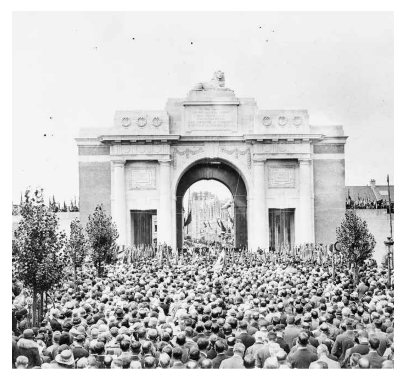
The Menin Gate, 1928

By the end of the Great War, the Imperial (now Commonwealth) War Graves Commission estimated that of the 'million dead' of the British Empire, only half had identified grave sites. The remainder were 'missing': their bodies had not been recovered; their graves had been unrecorded, lost or destroyed by battle; or their remains could not be