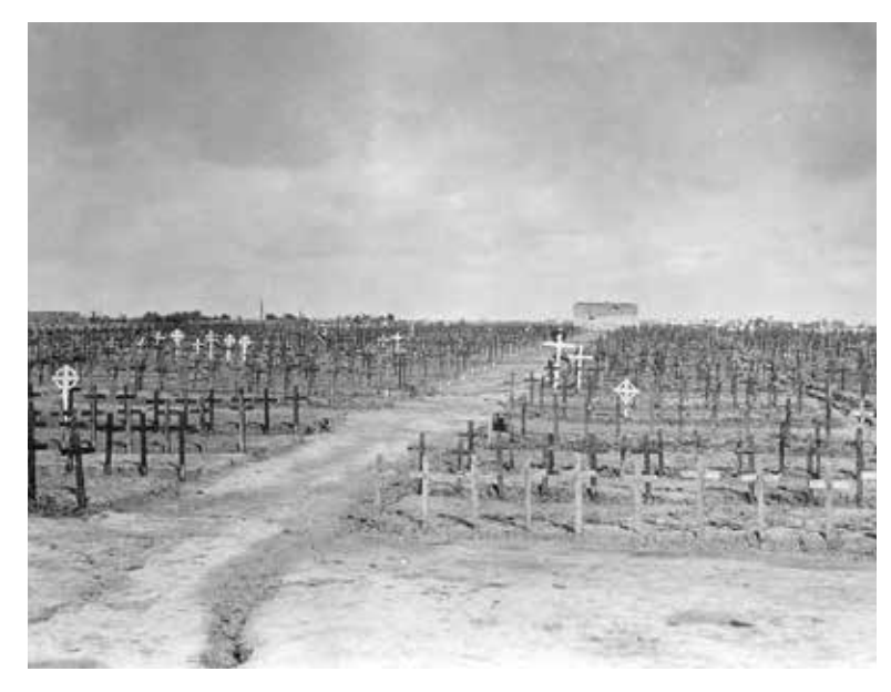
Tyne Cot Cemetery

of the Cross of Sacrifice. The concrete is still visible today, along with an inscription which reads: