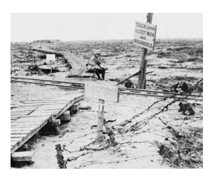
A German soldier seated on wooden track between Ypres and Passchendaele

soldiers broke out of their long-held foothold in Flanders and pushed the German Army back to the eastern Belgian border.