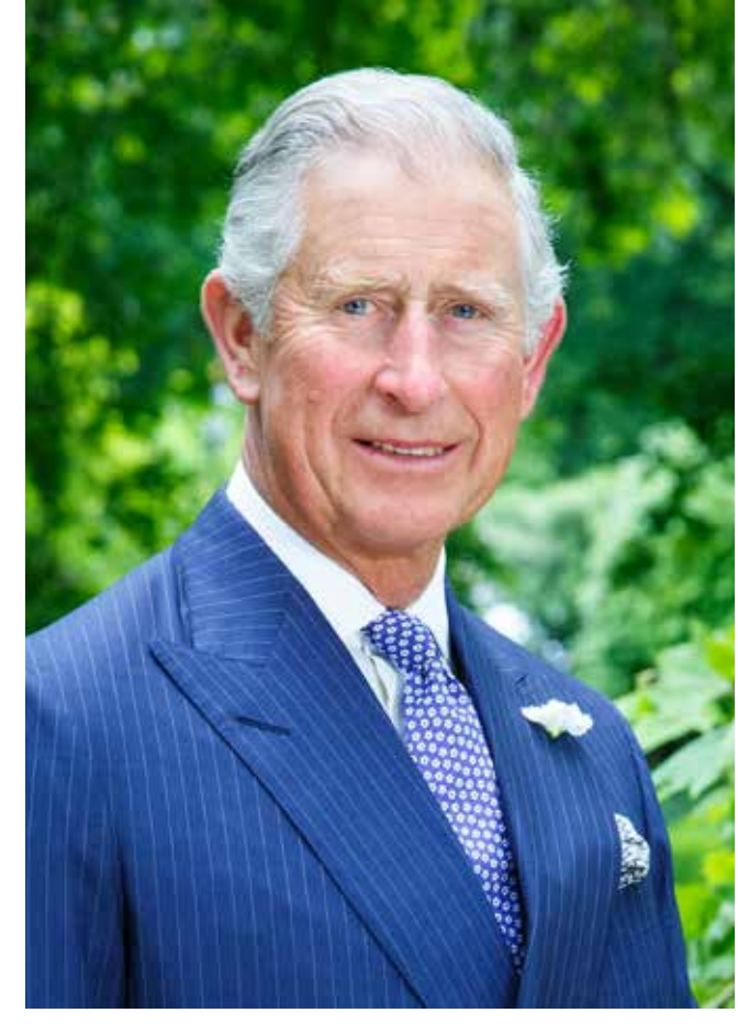
His Royal Highness The Prince of Wales