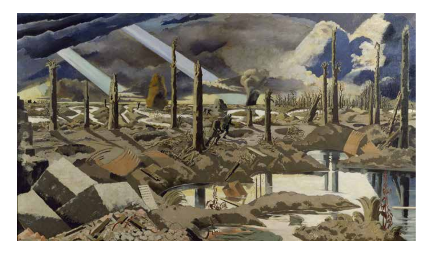
The Menin Road, Paul Nash

'I died in Hell – (they called it Passchendaele)'.