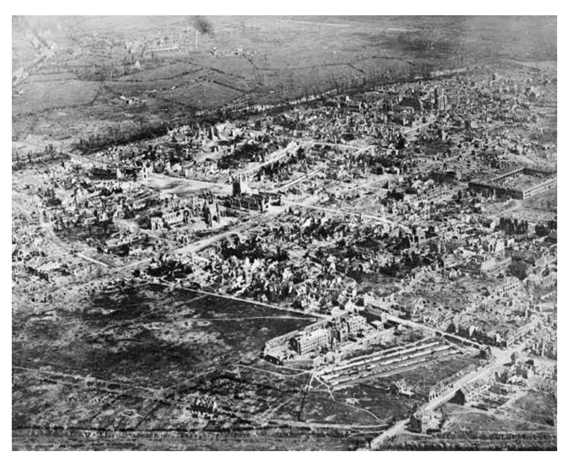
The ruins of Ypres