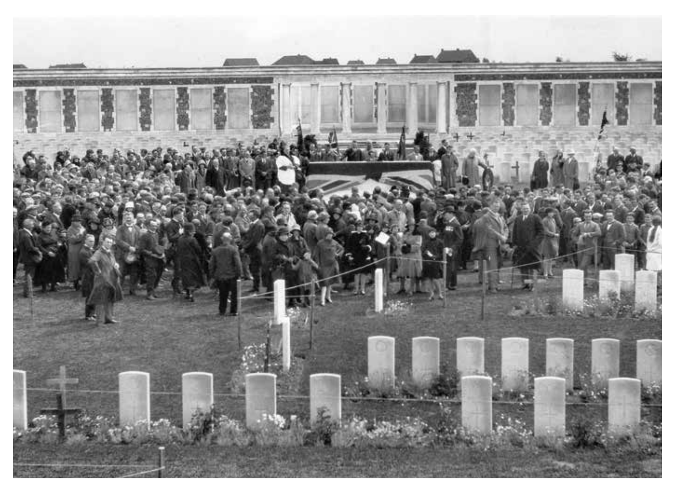
The unveiling ceremony of Tyne Cot Cemetery at the Stone of Remembrance

attended by hundreds of those who have come to pay their respects, in the long tradition of pilgrims and visitors stretching back to the 1920s.