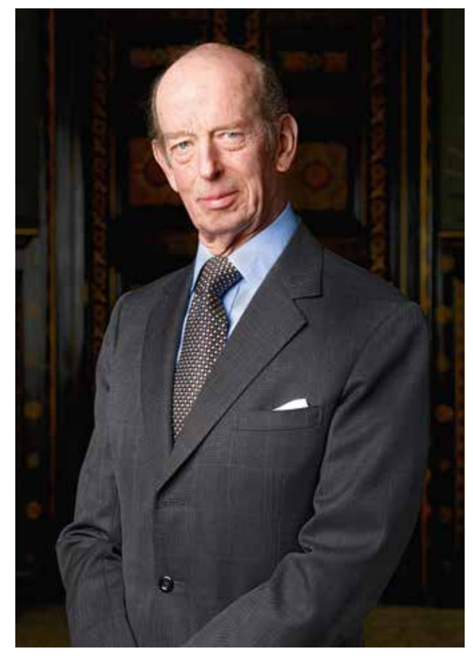
His Royal Highness The Duke of Kent President of the Commonwealth War Graves Commission