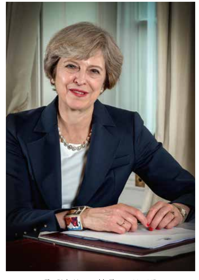
The Right Honourable Theresa May MP The Prime Minister of the United Kingdom of Great Britain and Northern Ireland