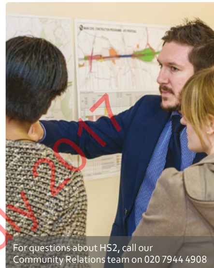
For questions about HS2, call our Community Relations team on 020 7944 4908

For more information, please review the 'Train types' factsheet.