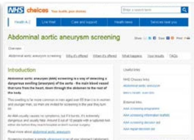
New look: the NHS Choices website, above, and the new AAA screening invitation leaflet, left