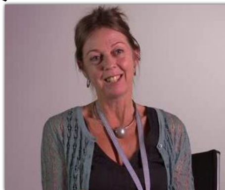
Watch taster video on the website

Development of the module is the result of a successful midwifery/laboratory study day in March which identified the importance of understanding how the samples are processed