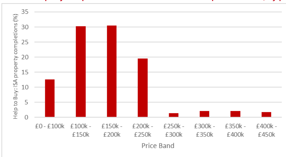
Chart 1: Property completions from December 2015 to September 2017, by property value