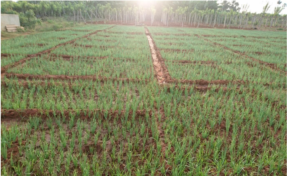
Onion and grapes are grown by resettled