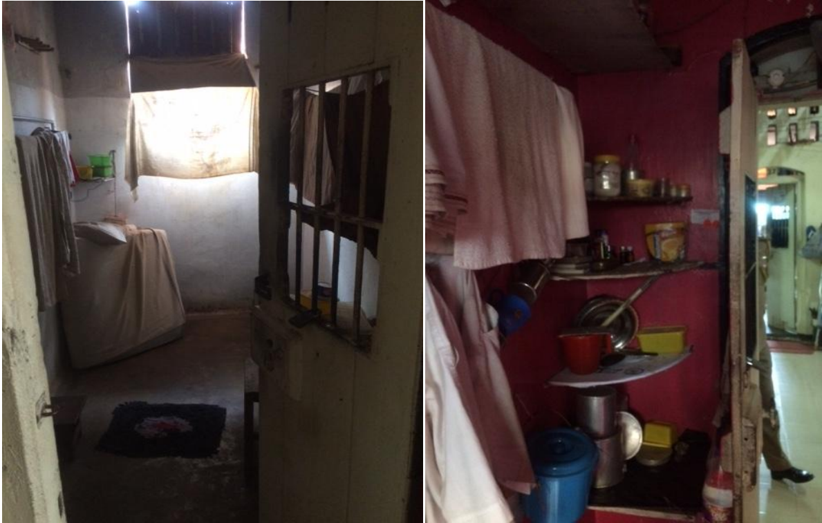
Inside of a prison cell