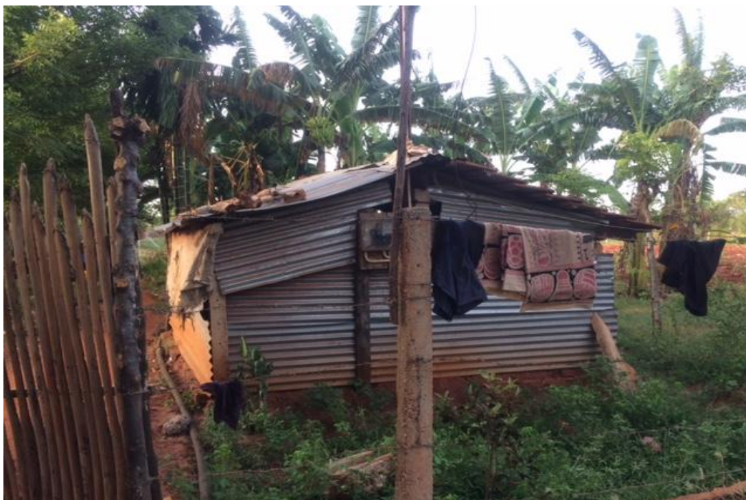
A house provided to a resettled family