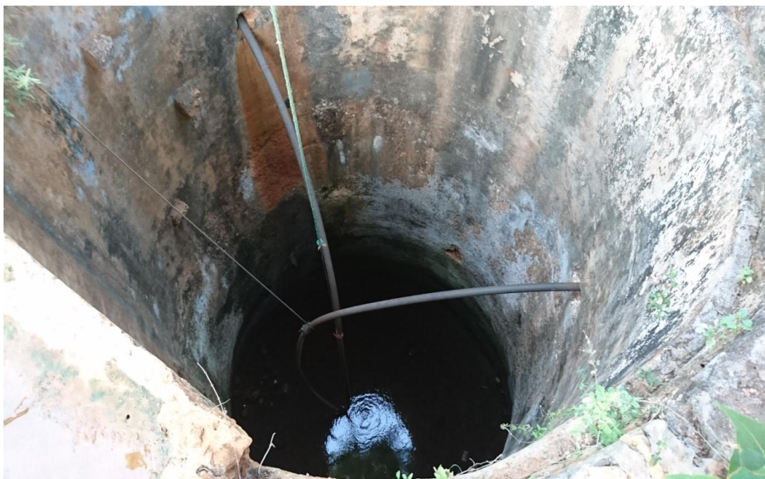
A water source for families