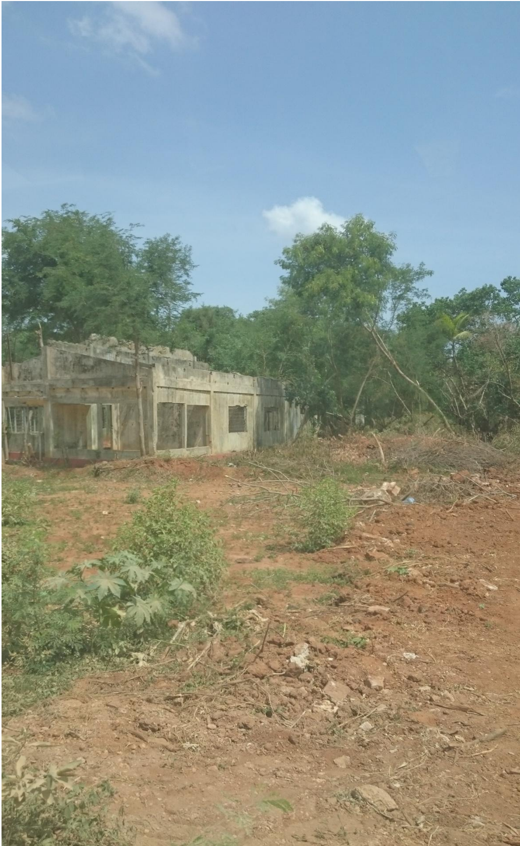
A derelict house in Jaffna