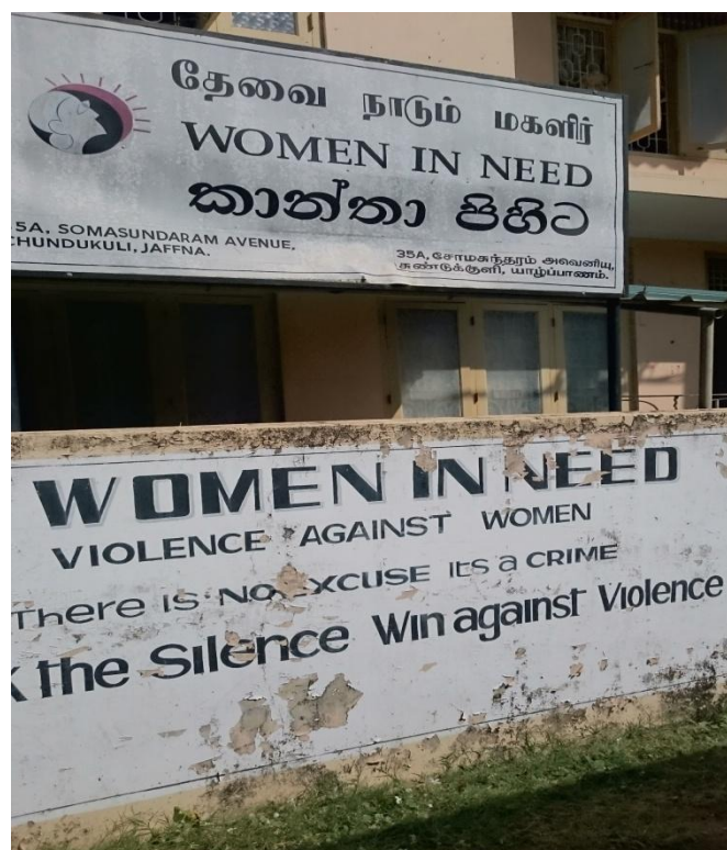
Women in Need offices in Jaffna