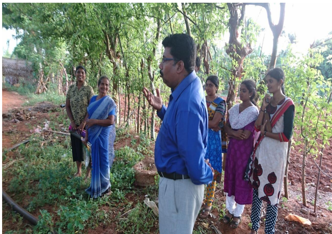
A resettled family in Jaffna