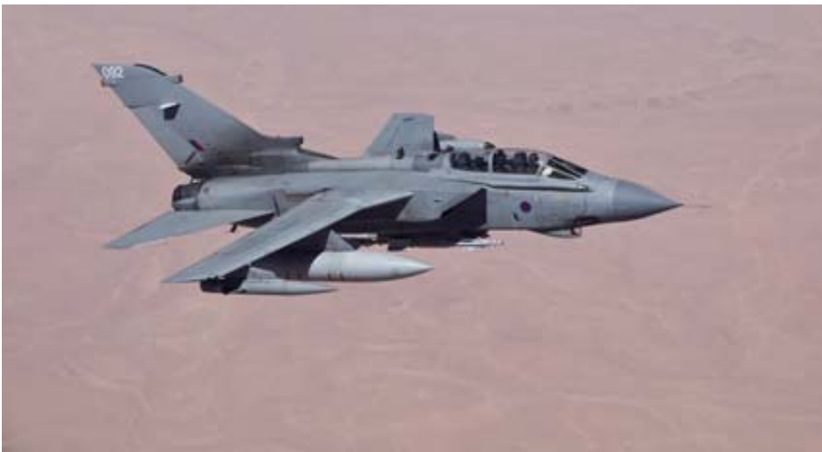
Figure 2: RAF Tornado GR4's over Iraq on an armed reconnaissance mission in support of Op SHADER.

During the latest quarter 1 January 2017 to 31 March 2017 (Q4 2016/17), there were no UK Entitled civilians who died as a result of deployment on operations or who sustained an injury or illness whilst on operations.