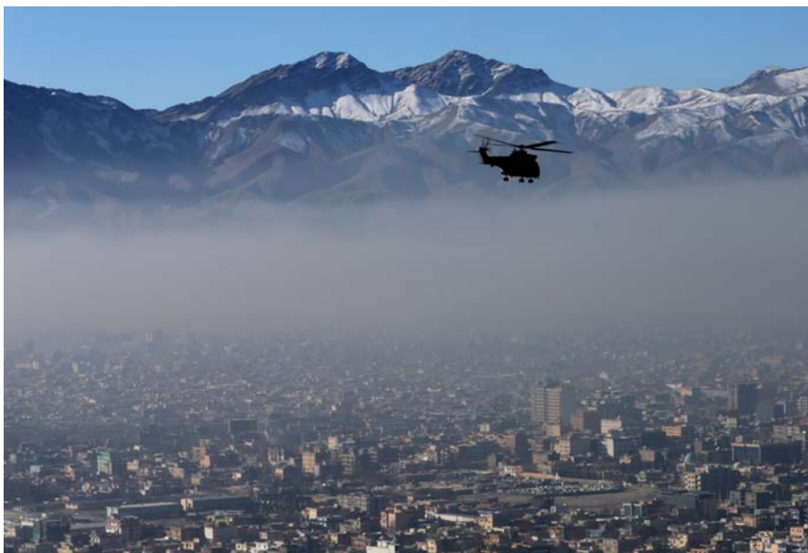
Figure 4: An RAF Puma deployed on Operation TORAL in Afghanistan

During the latest quarter 1 January 2017 to 31 March 2017 (Q4 2016/17), there were no UK Entitled civilians who died, sustained an injury or had an illness whilst on Op TORAL.