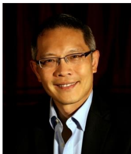
Dr Fu-Meng Khaw Centre Director

Established on 1 April 2013, the Public Health England Centre in the East Midlands brings together a number of services and statutory functions to deliver an integrated offer of services, advice and support to local stakeholders across the three domains of public health: health protection, health improvement and healthcare public health. Through our integrated approach we will support and add value to the work of our local stakeholders, working together to protect and improve health and reduce health inequalities across the East Midlands.