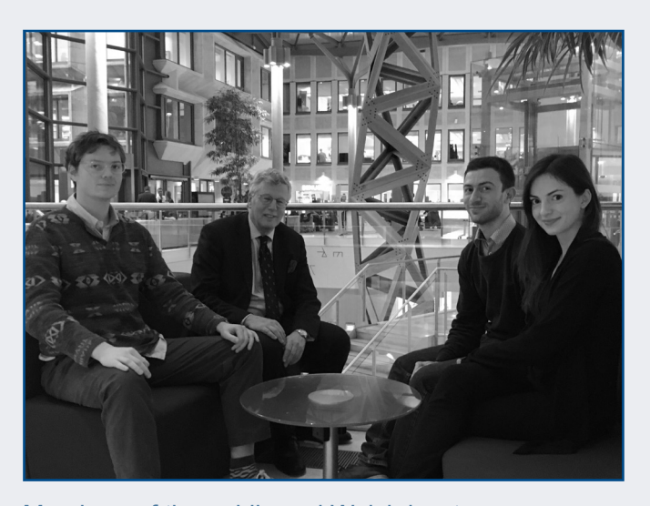
Members of the public and Welsh law team.

The Counsel General sent the Welsh Government's final response to our recommendations on 19 July 2017, agreeing or agreeing in principle with the vast majority. Crucially the Welsh Government "agrees that a sustained, long term programme of consolidation and codification of Welsh law would deliver societal and economic benefits, and is necessary to ensure that the laws of Wales are easily accessible".