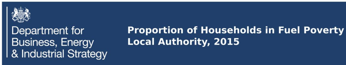
Figure 1.1: Proportion of households in fuel poverty, by Local Authority, 2015