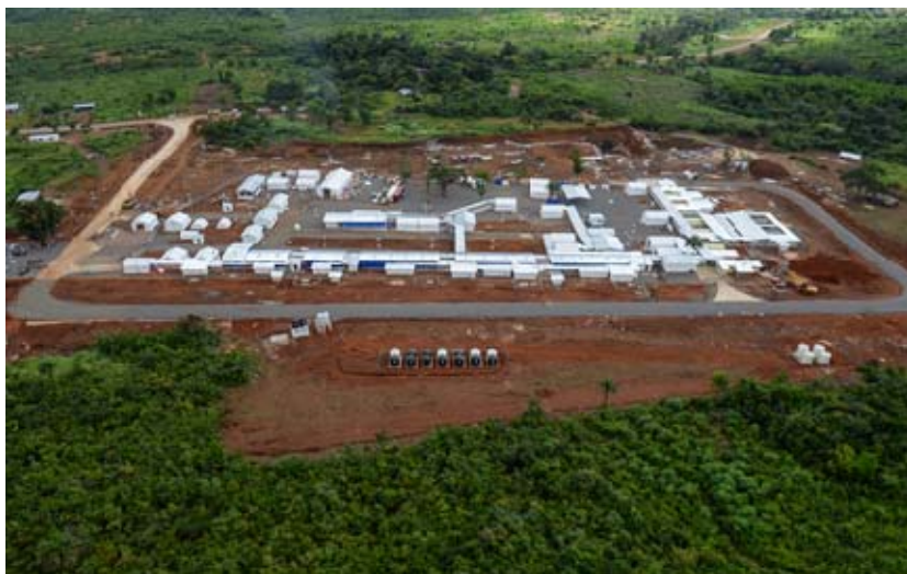
Figure 4: The Kerry Town Treatment Centre in Sierra Leone near the capital Freetown.

An Ebola treatment facility opened on the 5 November 2014 in Kerry Town, near the Sierra Leone capital Freetown. This facility was run by UK Military until 30 June 2015 when it was handed over to Aspen Medical by the deployed military team. The Kerry Town complex included an 80 bed treatment centre managed by Save the Children and a 12 bed centre staffed by UK military medics specifically for health care workers and international staff responding to the Ebola crisis. This section focuses only on those patients that were admitted to the 12 bed Health worker treatment centre run by the UK military.