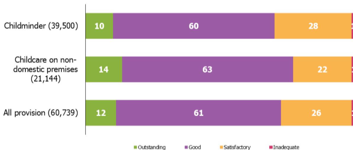
Chart 2: Overall effectiveness of active early years registered providers at their most recent inspection as at 31 December 2011, by provider type (provisional) 1 2

1. Percentages are rounded and do not always add exactly to 100.