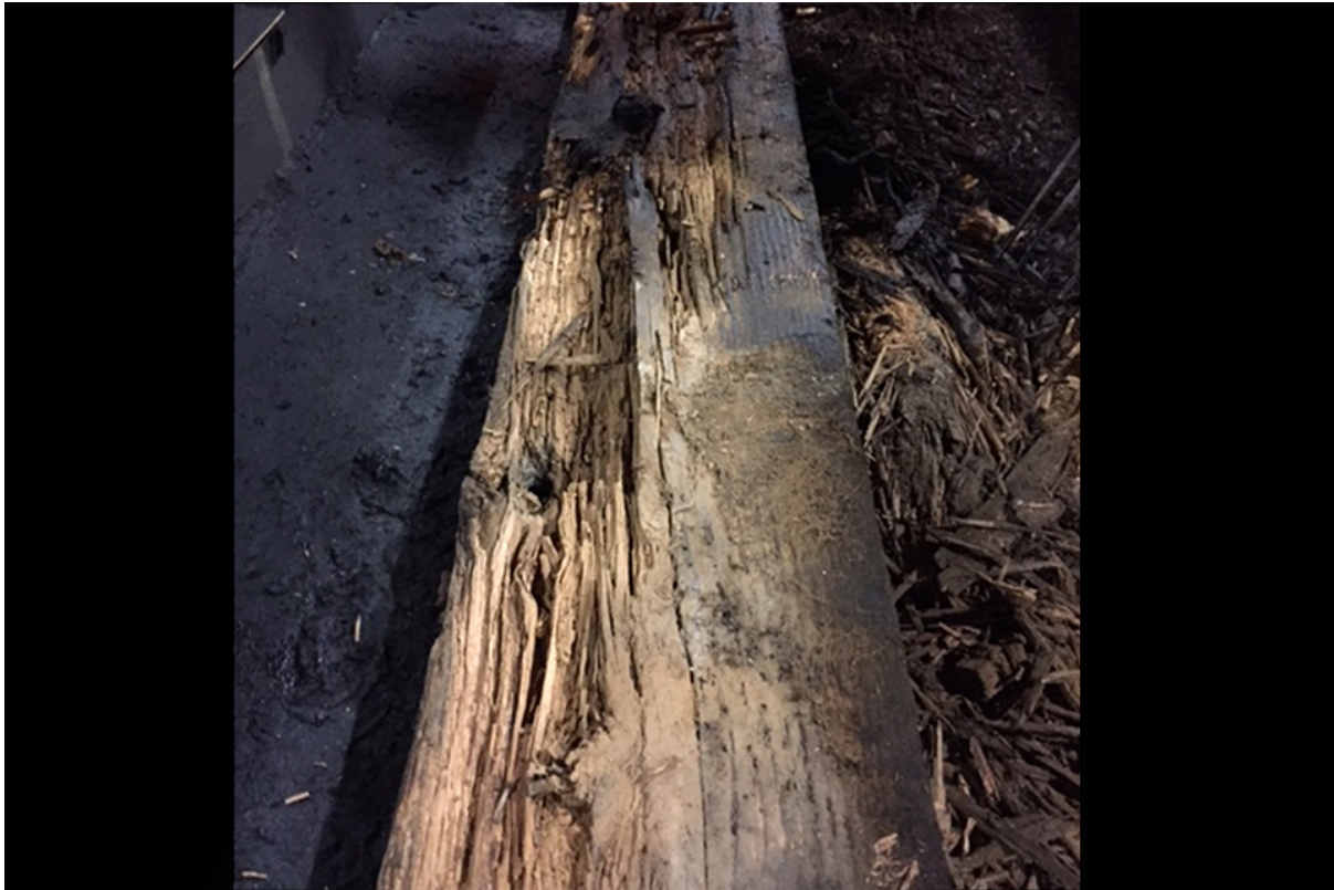
Underside of decayed right-hand timber

Replacement of the decayed timbers was subsequently planned for June 2017. However, witness evidence indicates that this work was postponed in order that works associated with electrification of the Great Western Main Line could be carried out. At the time of the accident on 20 August, replacement of the timbers had been rescheduled for September 2017.