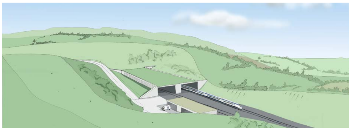
Figure 2. typical porous portals