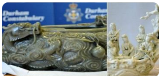
A jade bowl and porcelain figurine were taken in the Durham raid

Two suspects arrested for the Durham theft led investigators to link the crime to a wider network that was responsible for similar thefts from locations across the UK. Investigators went on to establish that an international organised crime group had undertaken a series of high-value thefts of artefacts worth £57million.