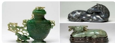
Chinese artefacts worth up to £15m were stolen from Cambridge's Fitzwilliam Museum in April 2012