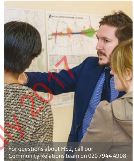
For questions about HS2, call our Community Relations team on 020 7944 4908

It also describes how the potential impacts of the preferred route compare with the scheme that was presented at consultation in 2013/14. Since consultation closed, the Department for Transport and HS2 Ltd have been drawing together consultation feedback, information, analysis and opinion from a number of sources.