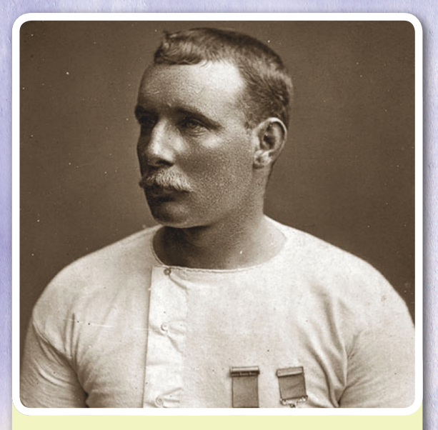
Swimming the English Channel