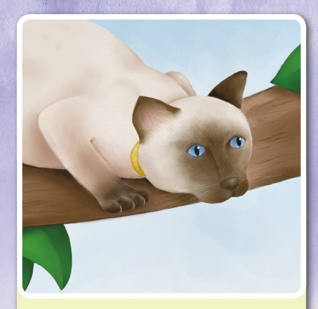
Gaby to the Rescue