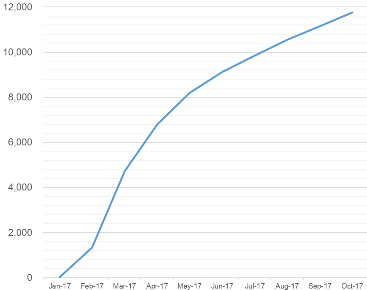
Figure 1: Total cumulative number of apprenticeship service accounts registered by month

Please note that the date of registration is the date the apprenticeship service account first registered their PAYE account number and organisation (legal entity) in the digital apprenticeship service system.