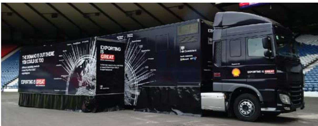
The Exporting is GREAT roadshow came to Edinburgh, Glasgow, Dundee and Aberdeen early in 2016

Practical examples of the collaborative approach being taken include UKTI's and SDI's delivery of the annual Explore Export event in Edinburgh on 6 November 2015, attended by over 150 businesses. Close partnership working between the Scotland Office, UKTI, Scottish Enterprise and the Scottish Council for Development and Industry was also essential to support the Exporting is GREAT roadshow launched in Glasgow on 29