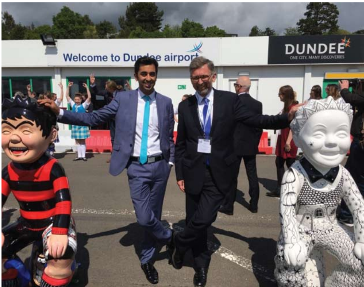
The UK Government also helped support a new Dundee – Amsterdam air link

Scottish flights support: air links between Dundee and London were secured for a further six months with the UK Government, the Scottish Government and Dundee City Council agreeing to extend the current public service obligation contract until the end of 2016. This created the chance for a longer term solution for this important connection for Dundee.