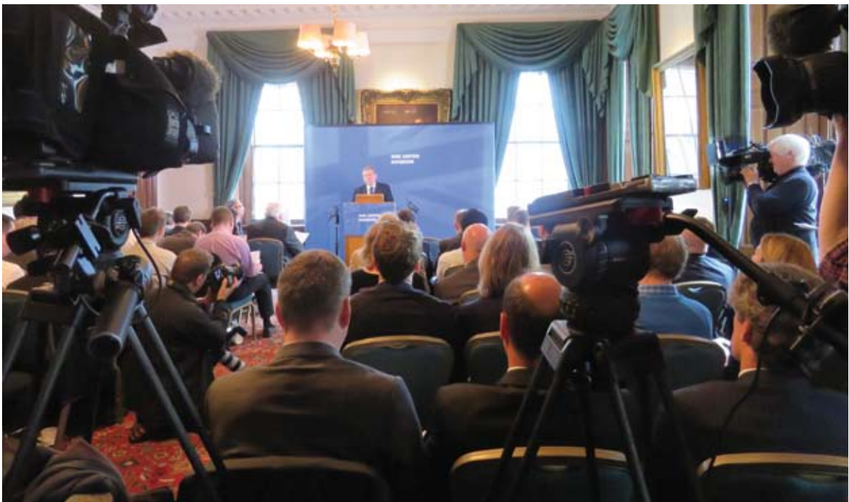
The Secretary of State made a number of key speeches on the future of devolution in Scotland

Over the past year, the Scotland Office has sought to engage and inform the public about the new powers in the Scotland Act 2016 through a programme of Ministerial speeches, campaigns and digital content, newspaper and television interviews, online information, social media and printed materials, stakeholder programmes, Ministerial visits, local authority engagement and attendance at public events.