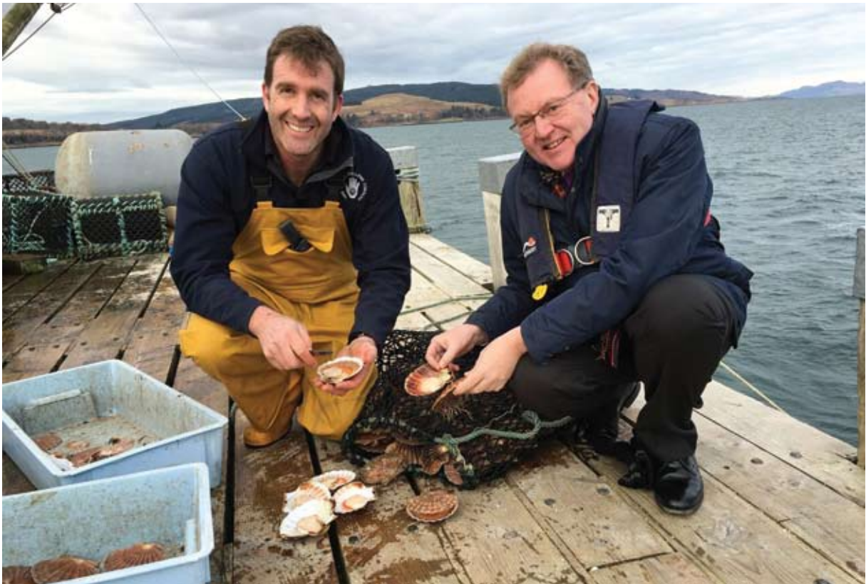
The Secretary of State on a visit to the Ethical Shellfish Company on the Isle of Mull