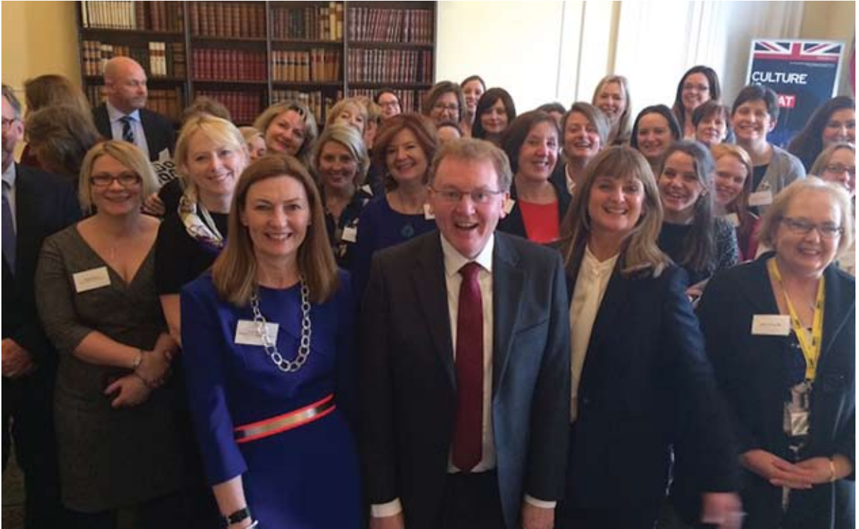
The Scotland Office hosted a reception to mark International Women's Day