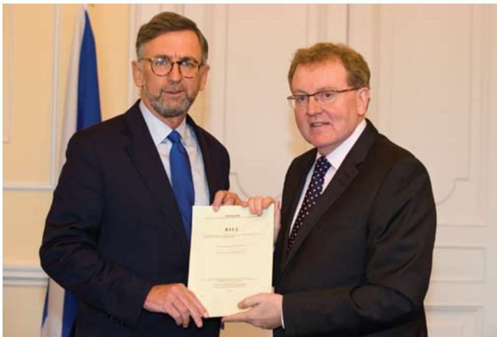
The Secretary Of State and Scotland Office Minister with the Scotland Act 2016

In September 2014 the people of Scotland voted in a referendum to remain part of the United Kingdom. Following the referendum, the Prime Minister asked Lord Smith of Kelvin to convene all five of Scotland's main political parties and reach a consensus on which additional powers should be devolved in order to improve the devolution settlement. The Smith Commission Agreement was published on 27 November 2014 and recommended a significant package of new powers for the Scottish Parliament.