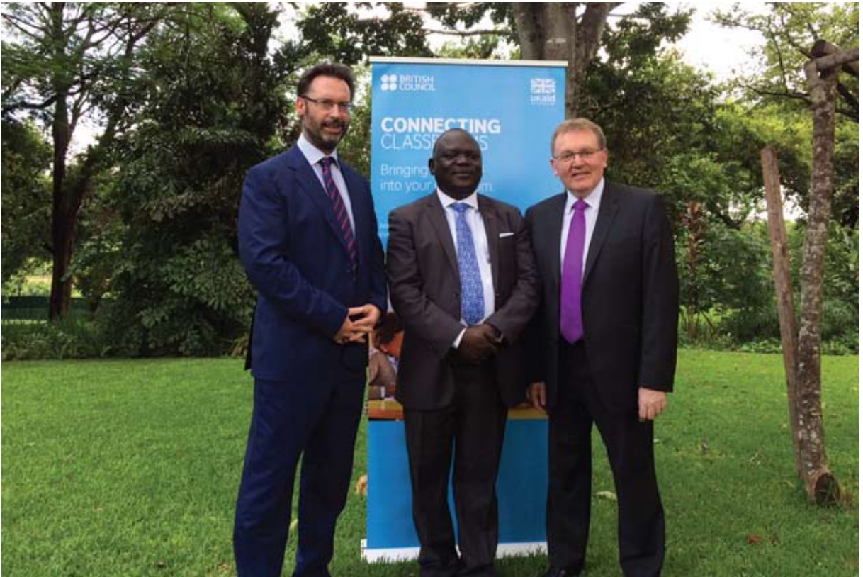
The Secretary of State on a visit to Malawi

The Secretary of State has also undertaken a highly successful international visit to Mozambique and Malawi which linked in with the work from the UK Government and Aberdeen City Council on oil and gas and the UK Government work on international aid. A ministerial visit to Texas to further support the North Sea sector took place in June.