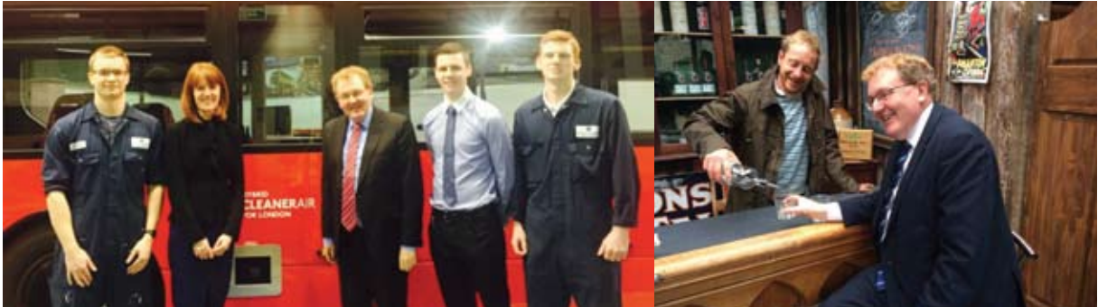
A ministerial visit to Alexander Dennis, one of the UK's leading bus and coach manufacturers. Scotland's growing gin sector also represented a real export success story this year.