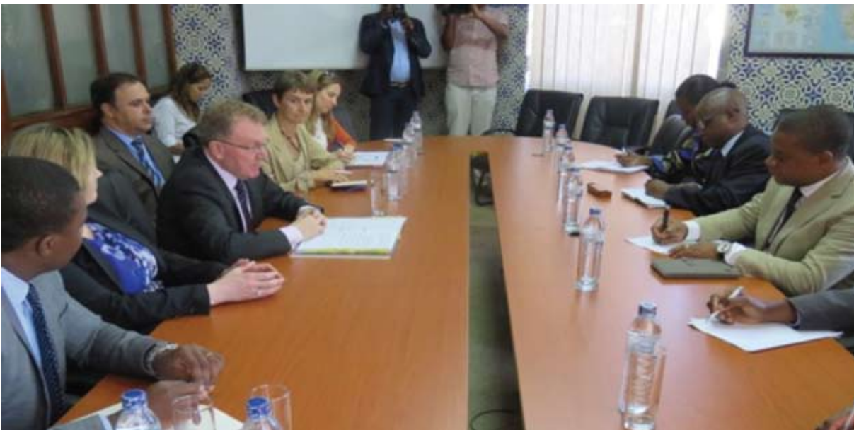
The Secretary of State promoting Scotch whisky exports at a meeting with Malawi's Trade Minister in February 2016

Scotch whisky protection in Mozambique: following the Secretary of State for Scotland's visit to Mozambique (February 2016) and his meeting with the Minister of Industry and Commerce, State officials confirmed Scotch whisky as a Geographical Indication. Described as a "legal breakthrough" by the Scotch Whisky Association, the protection will help Scottish distillers maximise the value of this important new market.