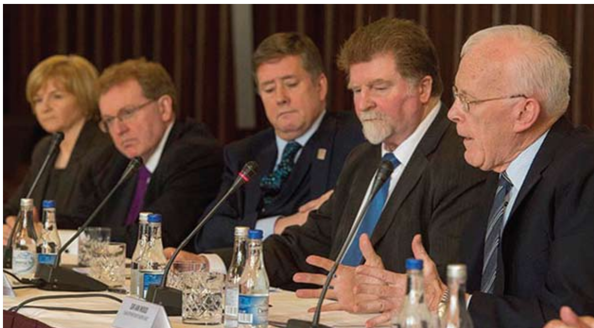
The Secretary of State at the signing of the Aberdeen City Region Deal

Building on the success of the Glasgow and the Clyde Valley City Region Deal, the Scotland Office has played a central role in the development of further Scottish City Region Deals in 2015-16. This includes the Aberdeen City Region Deal, announced on the 28 January 2016 and the Inverness City Region Deal, announced on the 22 March 2016. The Chancellor of the Exchequer also announced the UK Government's intention to formally commence negotiations with all partners engaged in the proposals for an Edinburgh and South East Scotland City Region Deal in his 16 March 2016 Budget.