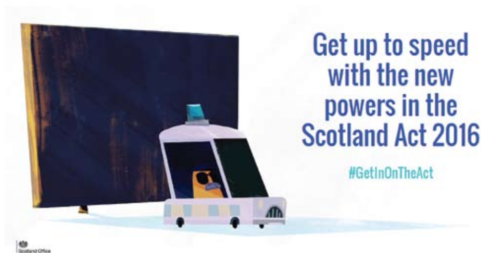
A new animation outlined the new powers of the Scotland Act 2016

Building on our increasing digital focus, we worked with the Edinburgh College of Art's animation department. The result was a world-class two-minute film produced by a third year student. This showed the transfer of powers and the different responsibilities of the two governments in an engaging, light-hearted way. A key aim here was to ensure the Scotland Office's messages reached out to new audiences across Scotland in an interesting way. This project was very successful and the team will build on its success in the coming year.