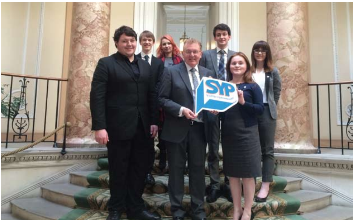
The Scotland Office welcomed a delegation from the Scottish Youth Parliament

Alongside Scotland Office engagement, officials support other government departments to expand and enhance their outreach and activity in Scotland. Examples include the Maritime and Coastguard Agency holding events supported by Scotland Office officials on the issue of Emergency Towing Vessels; facilitation of meetings for the Home Office's Permanent Secretary with key stakeholders on the resettlement of Syrian refugees in Scotland; and developing a programme of visits and meetings for the Cabinet Secretary in Scotland.