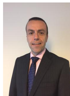
Kevin Leggett Governor, HMP The Mount