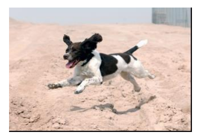
Figure 3: Dogs perform a vital role in the fight against terrorism by seeking out IEDs and hidden weapons

4. Between 1 March 2012 and 31 August 2013 the UK Significant Actions (SIGACTs) data is included in the LORD