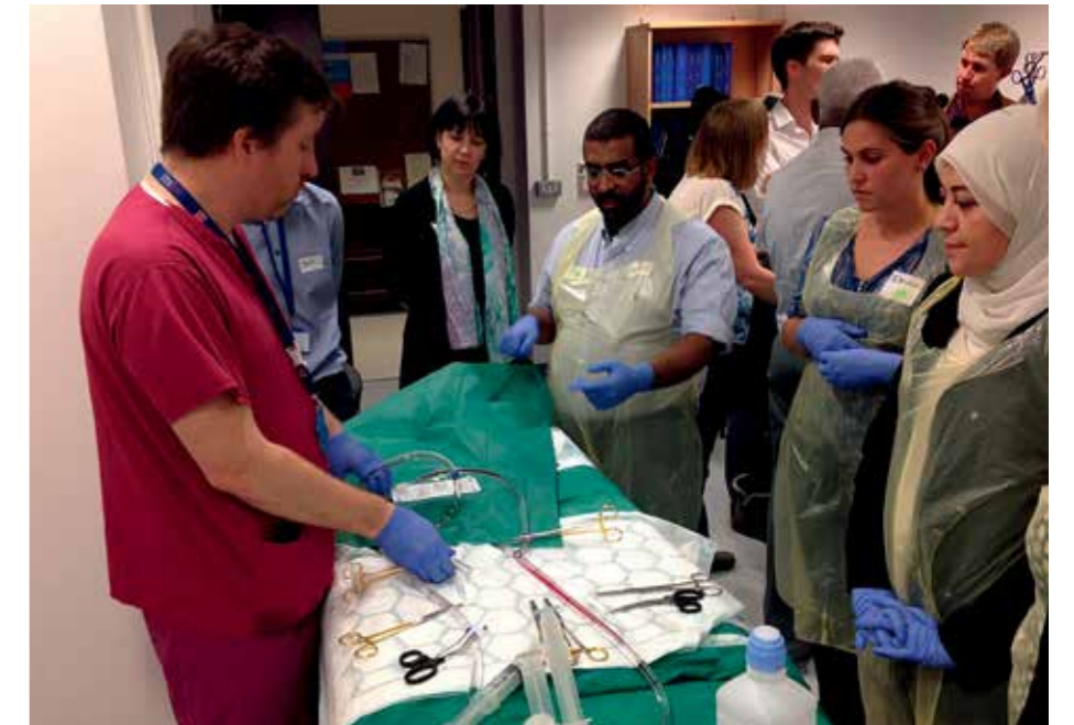
Multidisciplinary teams from Qatar and St Thomas' learning emergency ECMO together

There are a range of potential service models that NHS organisations might consider deploying to generate revenue from outside the UK.