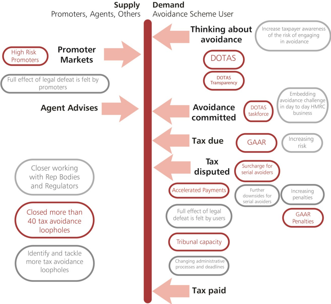
Figure 3.B: Action taken to tackle avoidance in this Parliament, and future areas for consideration