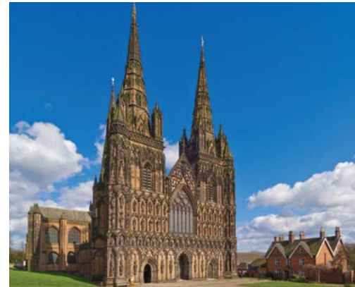
Lichfield Cathedral, Staffordshire

We're extremely aware of the issues that building a new railway presents to those who live nearby, and we take our responsibility to you very seriously. Ultimately, we want to make HS2 mean something positive to everyone, whether it stands for fairness and clarity, better training for current and future engineers, a catalyst for jobs and investment in your area, a world-class railway or simply a new and exciting way to travel.