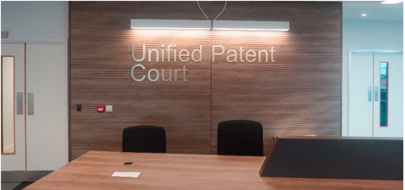
The Life Sciences and Pharmaceutical Division will be in London.