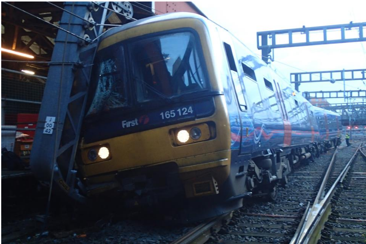
The front of the derailed train and the OLE mast, after the accident

Train 1H52, departing for Henley-on-Thames, had begun to move along platform 1, when the derailment caused the signal at the end of the platform to revert to red. The driver stopped his train before reaching that signal, and the passengers on the train were able to disembark onto the platform.