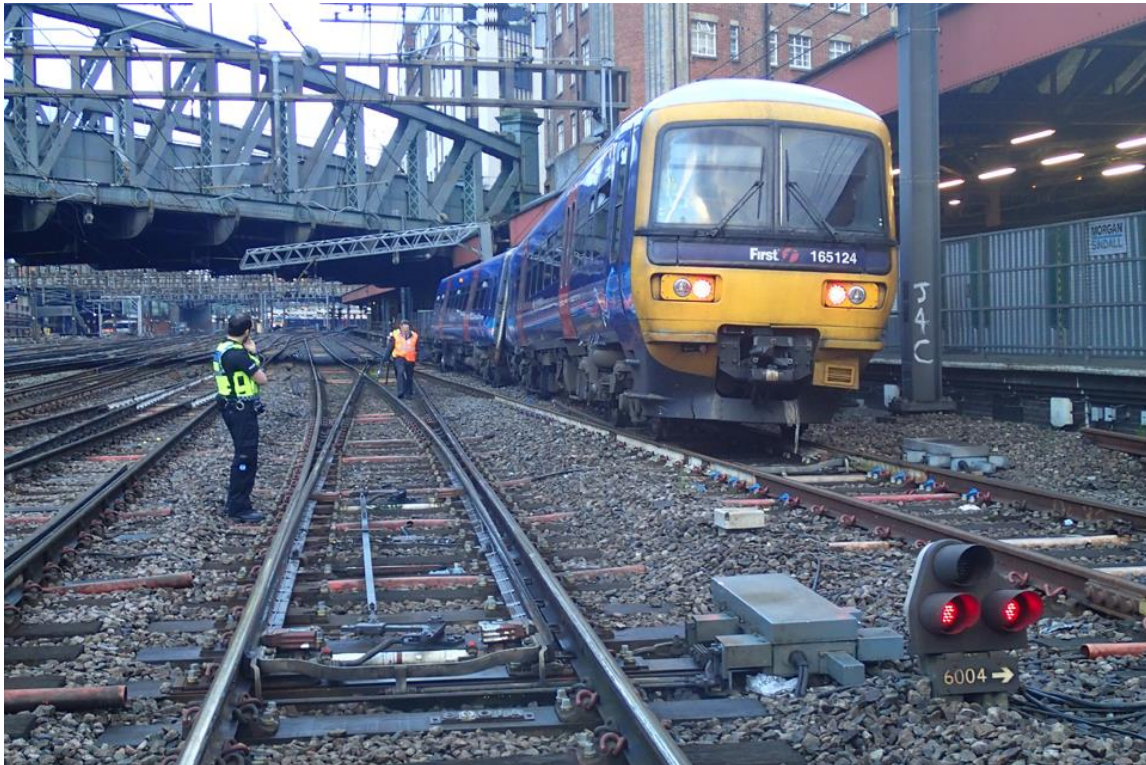
The train from the rear after the derailment. Signal SN6004 is at the bottom right

However, the conversation between the signaller and the driver should have resulted in the driver understanding that his train could not enter the station until the 18:12 hrs departure had left.