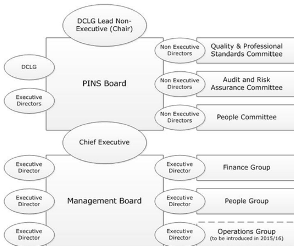
Figure 2: The Planning Inspectorate's governance structure

The structure of the Board meetings has changed with the introduction of a formal report from the Chief Executive, and the introduction of a new KPI scorecard. The second part of the new format meetings was allocated to strategic issues.