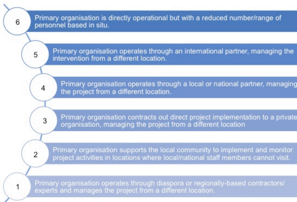
Figure 1: Remote Management Arrangements

Some organisations use only one method of remote management while others employ a broad range. The choice of programming approaches depends on the capacity of the organisation, the project location and type of project (Hansen, 2008; Donini, 2011).