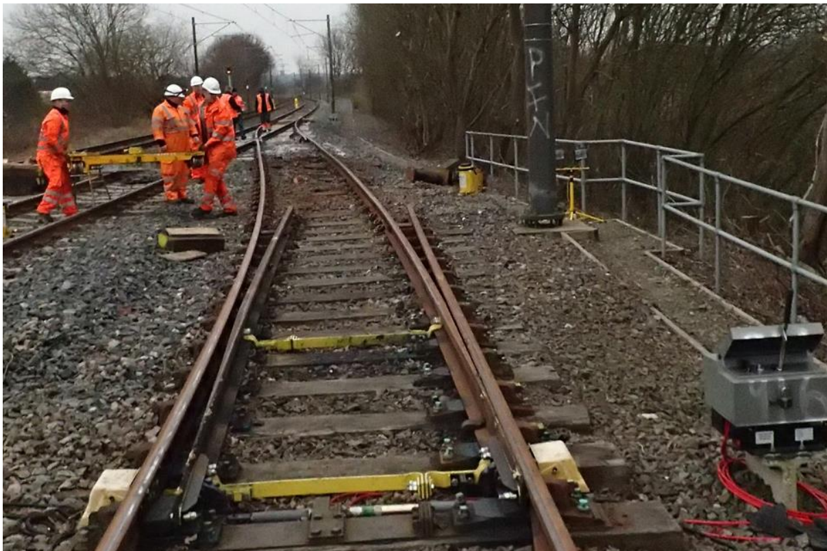
304B points. Shown set to 'reverse'

On hearing a shouted warning that the MPV was running away, the driver, who had returned to the southern cab, also jumped to the track. However, as the MPV passed him, he managed to pull himself back on board the moving vehicle and to enter the northern cab, where he also unsuccessfully attempted to use the controls to stop the MPV. He remained aboard the MPV as it derailed on 304B points, but did not suffer any injuries. The MPV achieved a speed of around 13 mph (20 km/h) during the runaway. It remained upright during the derailment and did not descend the embankment located adjacent to the cess. It did, however come to a rest in a position foul of northbound tram movements.