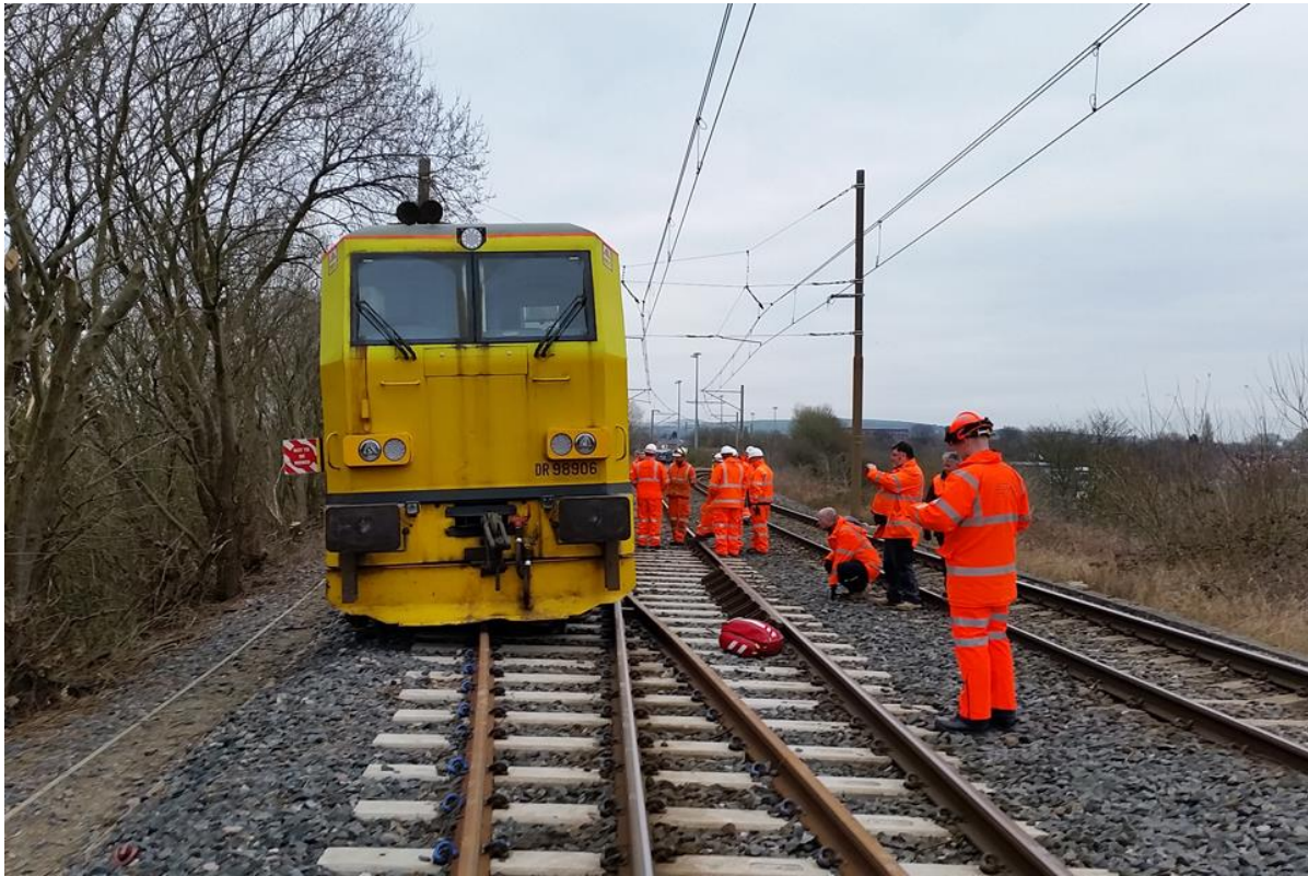
The derailed MPV