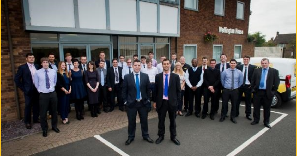
Employ nearly 50 staff