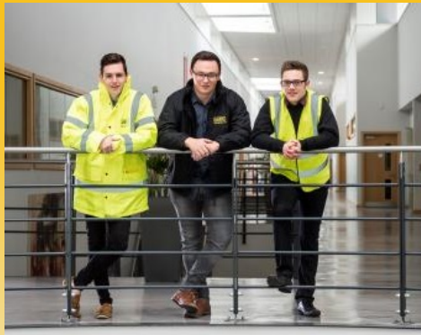
10% of staff are apprentices