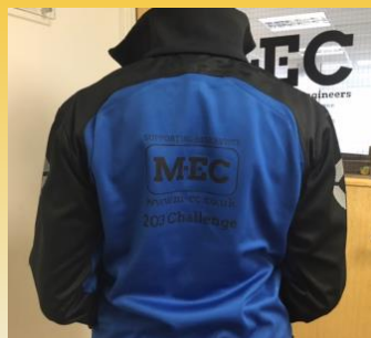
Sponsored training tops awarded to reservists at local squadron