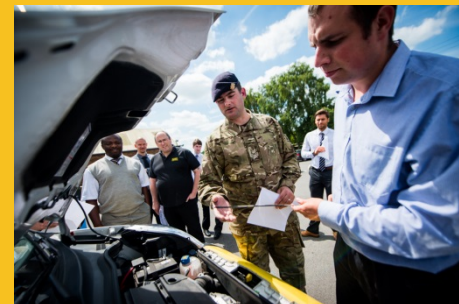
Vehicle safety demonstration event for staff and neighbouring companies