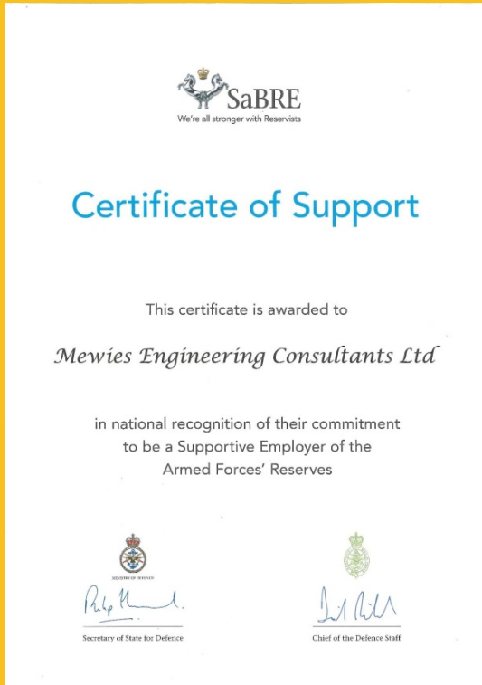
Certificate of Support February 2014