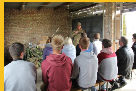
Army Activity Day – Kendrew Barracks