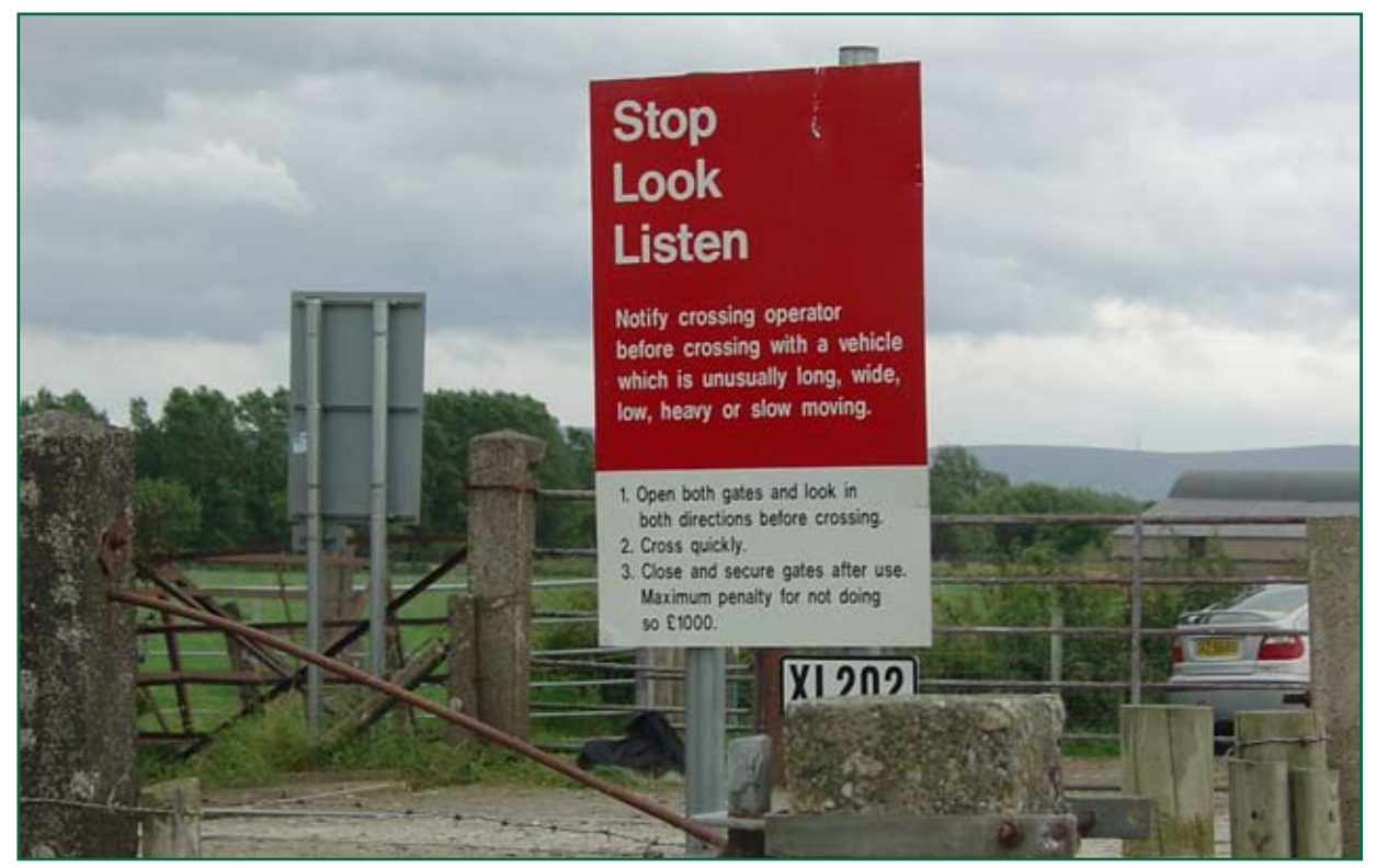
Figure 2: Signage at crossing XL202 (3 August 2007)