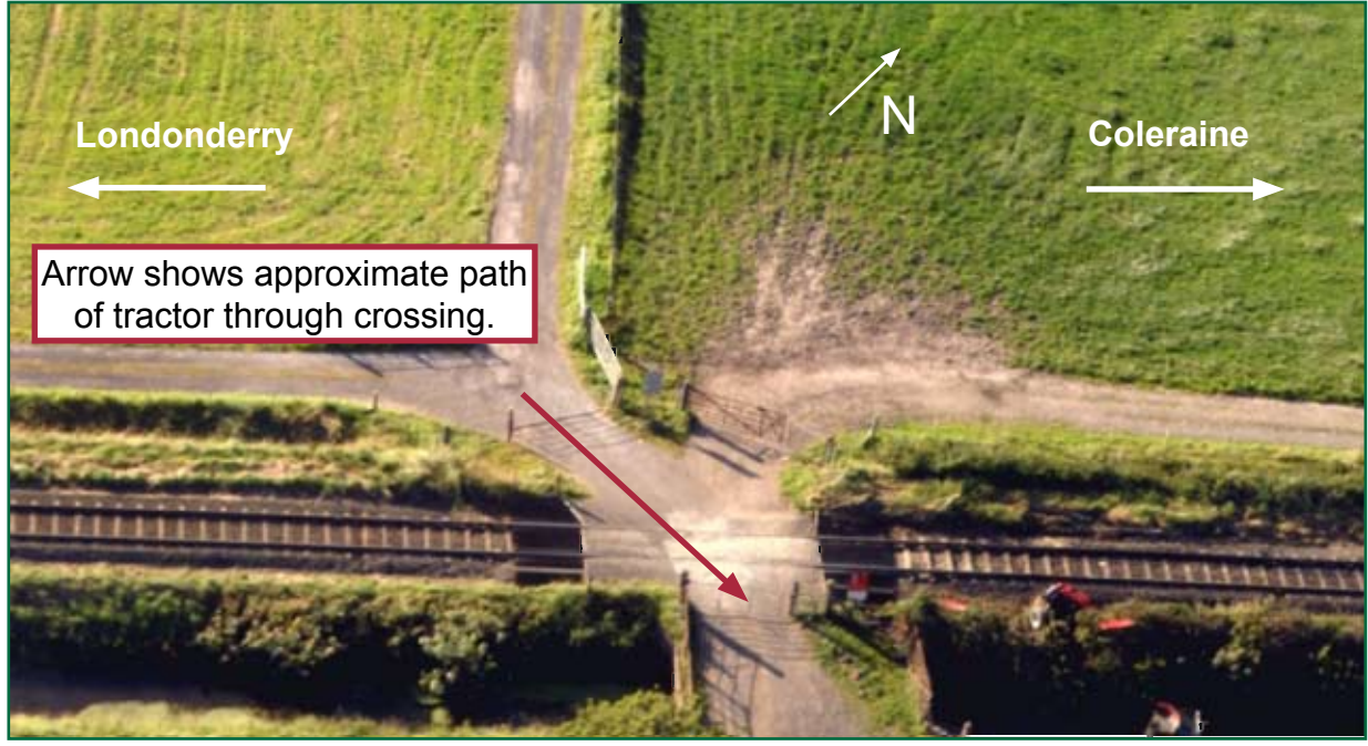
Figure 5: Aerial photograph of crossing XL202 showing 'dog-leg' (2August 2007)

89 When crossing at an angle, the tractor driver's view to the railway on the right could have been affected by the tractor's roof support pillar when the tractor driver was sitting upright in the seat. This would have started to occur just as the tractor was approaching the railway (approximately three seconds before it reached the point where conflict with the train was inevitable and approximately six seconds before the time when impact occurred) and continued until the time of impact. The presence of the roof support pillar may have impeded the tractor driver's peripheral vision, preventing him becoming aware of the train until it was too late. Even if he had glanced quickly to his right, the presence of the pillar and the bright sunlight coming in through the tractor's right-hand window may have combined to make seeing the approaching train difficult.