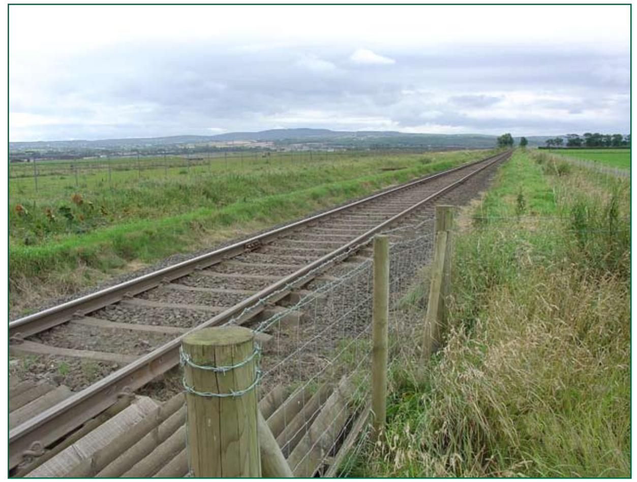
Figure 4: The view towards Londonderry from the north side of crossing XL202 (3 August 2007)