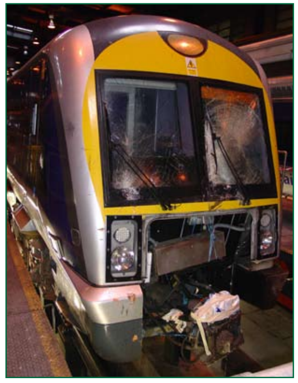
Figure 3: Damage to the front of unit 3014 (3 August 2007)